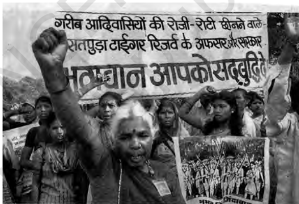
Struggles of the tribals continue

Different tribal groups spread across the country may share common issues. But the distinctions between them are equally significant. Many of the tribal movements have been largely located in the so called 'tribal belt' in middle India, such as the Santhals, Hos, Oraons, Mundas in Chota Nagpur and the Santhal Parganas. The region constitutes the main part of what has come to be called Jharkhand.