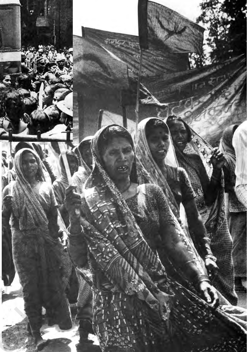
Right: Women workers at a Union Demonstration, Arwal, Bihar 1987