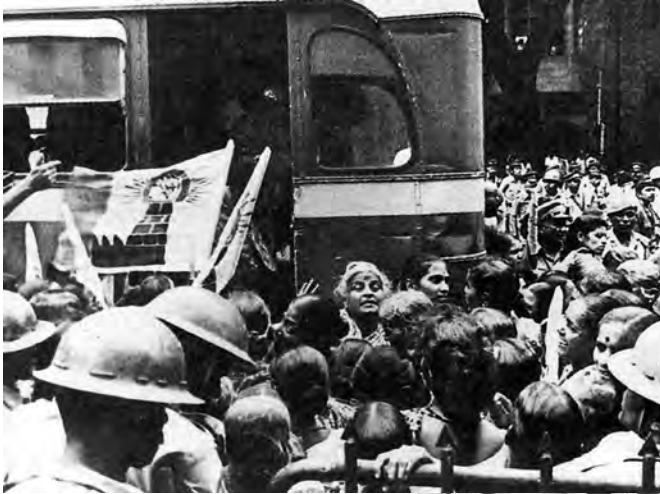
Top: Bombay textile worker's strike 1981–82