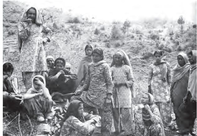
Discussing deforestation, Junagadh, Himachal Pradesh

This conflict placed the livelihood needs of poor villagers against the government's desire to generate revenues from selling timber. The economy of subsistence was pitted against the economy of profit. Along with this issue of social inequality (villagers versus a government that represented commercial, capitalist interests), the Chipko Movement also raised the issue of ecological sustainability. Cutting down natural forests was a form of environmental destruction that had resulted in devastating floods and landslides in the region. For the villagers, these 'red' and 'green' issues were interlinked. While their survival depended on the survival of the forest, they also valued the forest for its own sake as a form of ecological wealth that benefits all. In addition, the Chipko Movement also expressed the resentment of hill villagers against a distant government headquartered in the plains that seemed indifferent and hostile to their concerns. So, concerns about economy, ecology and political representation underlay the Chipko Movement. Trees are necessary for the conservation of environment. Similarly, clean water is necessary for a healthy environment. In the light of this, the Government of India since 2014 has initiated systematic efforts to bring balance, structure and quality of India's ecology through the 'Integrated Ganga Conservation Mission' ( Namami Gange ) and 'Swachh Bharat Abhiyan'.