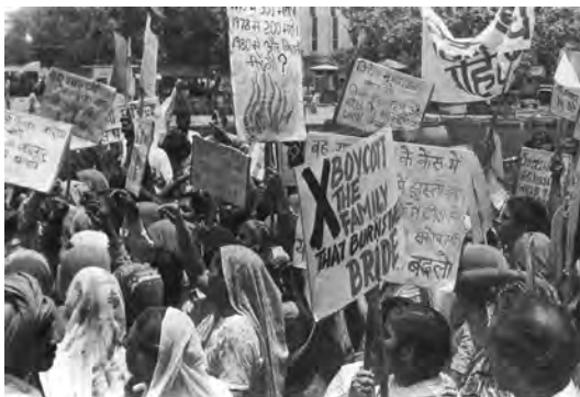
Struggle against dowry

Apart from organisational changes, there were new issues that were focussed upon. For instance, violence against women. Over the years, there have been numerous campaigns that have been taken up. You may have noticed that application for school forms have both father's and mother's names. This was not always true. Likewise, important legal changes have taken place thanks to the campaign by the women's movement. Issues of land rights, employment have been fought alongside rights against sexual harassment and dowry.