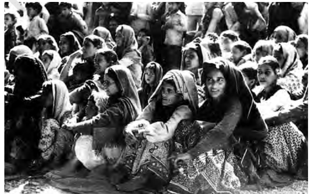
Chipko activists gather on World Environment Day at Saklana in 1986

and ideologies. According to Ramachandra Guha in his book, Unquiet Woods , villagers rallied together to save the oak and rhododendron forests near their villages. When government forest contractors came to cut down the trees, villagers, including large number of women, stepped forward to hug the trees to prevent their being felled. At stake was the question of villagers' subsistence. All of them relied on the forest to get firewood, fodder and other daily necessities.