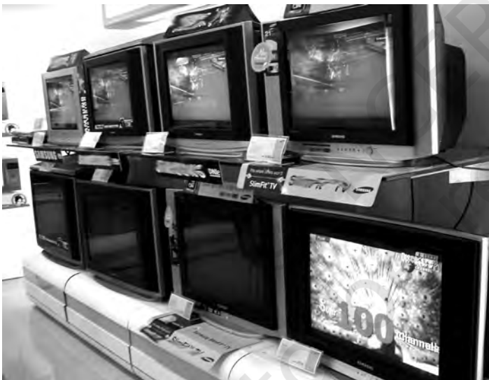
A television showroom

In 1991 there was one state controlled TV channel Doordarshan in India. By 1998 there were almost 70 channels. Privately run satellite channels have multiplied rapidly since the mid-1990s. While Doordarshan broadcasts over 35 channels there were about 900 private television networks broadcasting in 2020. The staggering growth of private satellite television has been one of the defining developments of contemporary India. In 2002, 134 million individuals watched satellite TV on an average every week. This number went up to 190 million in 2005. The number of homes