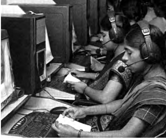
A Call Centre

A new international division of labour has emerged in which more and more routine manufacturing production and employment is done in the Third World cities. You have already dealt with outsourcing in Chapter 4 and contract farming in Chapter 5. Here we simply draw upon the example of Nike company to illustrate how this works.