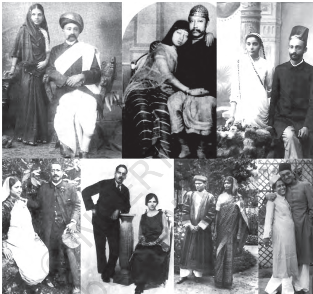
Couples from different regions 1880s to 1930s: Clockwise from top left corner: Gujarat; Tripura; Bombay; Aligarh; Hyderabad; Goa; Calcutta. From Malavika Karlekar, Visualising Indian Women 1875–1947, Oxford University Press, New Delhi.

Note: In this chapter, the word “State” has a capital S when it is used to denote the federal units within the Indian nation-state; the lower case ‘state’ is used for the broader conceptual category.