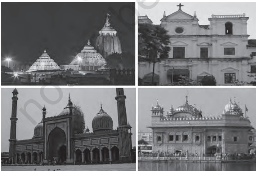
Images of different religious places

In everyday language, the word ' communalism ' refers to aggressive chauvinism based on religious identity. Chauvinism itself is an attitude that sees one's own group as the only legitimate or worthy group, with other groups being seen – by definition – as inferior, illegitimate and opposed. Thus, to simplify further, communalism is an aggressive political ideology linked to religion. This is a peculiarly Indian, or perhaps South Asian, meaning that is different from the sense of the ordinary English word. In the English language, "communal" means something related to a community or collectivity as different from an individual. The English meaning is neutral, whereas the South Asian meaning is strongly charged. The charge may be seen as positive – if one is sympathetic to communalism – or negative, if one is opposed to it.