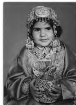
A Kashmiri girl

To be effective, the ideas of inclusive nationalism had to be built into the Constitution. For, as already discussed (in section 6.1), there is a very strong tendency for the dominant group to assume that their culture, language or religion is synonymous with the nation state. However, for a strong and democratic nation, special constitutional provisions are required to ensure the rights of all groups and those of minority groups in particular. A brief discussion on the definition of minorities will enable us to appreciate the importance of safeguarding minority rights for a strong, united and democratic nation.