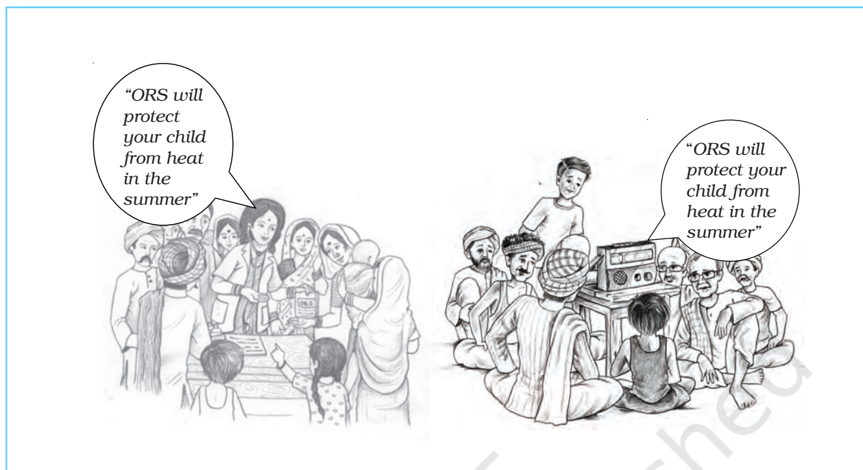
Fig.6.3 : Face-to-face Interaction versus Media Transmission. Which one works better? Why?

Finally, the mode of spreading the message plays a significant role. Face-to-face transmission of the message is usually more effective than indirect transmission, as for instance, through letters and pamphlets, or even through mass media. For example, a positive attitude towards Oral Rehydration Salts (ORS) for young children is more effectively created if community social workers and doctors spread the message by talking to people directly, than by only describing the benefits of ORS on the radio (see Figure 6.3). These days transmission through visual media such as television and the Internet are similar to face-to-face interaction, but not a substitute for the latter.