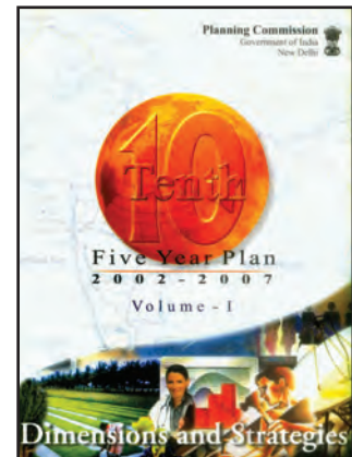
Tenth Five Year Plan document

The Second FYP stressed on heavy industries. It was drafted by a team of economists and planners under the leadership of P. C. Mahalanobis. If the first plan had preached patience, the second wanted to bring about quick structural transformation by making changes simultaneously in all possible directions. Before this plan was finalised, the Congress party at its session held at Avadi near the then Madras city, passed an important resolution. It declared that 'socialist pattern of society' was its goal. This was reflected in the Second Plan. The government imposed substantial tariffs on imports in order to protect domestic industries. Such protected environment helped both public and private sector industries to grow. As savings and investment were growing in this period, a bulk of these industries like electricity, railways, steel, machineries and communication could be developed in the public sector. Indeed, such a push for industrialisation marked a turning point in India's development.