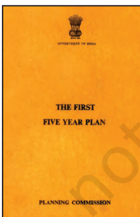
First Five Year Plan document