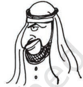
Sheikh Petrodollah King of the land of Black Gold

I value precious things. Bigoil says his President values freedom and democracy. So I keep both safely under lock and key in my land.