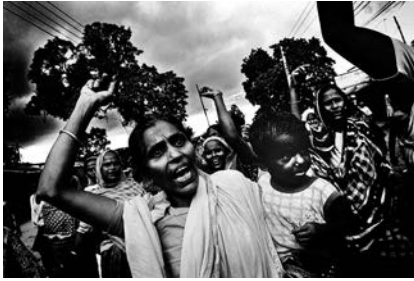
An entire community erupted in protests against a proposed open-cast coal mine project in Phulbari town, in the North-West district of Dinajpur, Bangladesh. Here several dozen women, one with her infant child, are chanting slogans against the proposed coal mine project in 2006.

are now being re-opened to MNCs through the liberalisation of the global economy. The mineral industry's extraction of earth, its use of chemicals, its pollution of waterways and land, its clearance of native vegetation, its displacement of communities, amongst other factors, continue to invite criticism and resistance in various parts of the globe. One good example is that of the Philippines, where a vast network of groups and organisations campaigned against the Western Mining Corporation (WMC), an Australia-based multinational company. Much opposition to the company in its own country, Australia, is based on anti-nuclear sentiments and advocacy for the basic rights of Australian indigenous peoples.