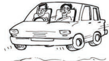
Mr & Mrs Gobbledoo

A new beauty is parked outside our garage. Awesome! Isn't it?... sleek chrome finish, power steering, automatic gears. Excellent pick up and great mileage too. It is low on emissions too...gentle on the atmosphere, you know. Global warming and all that stuff. Now we really are in hurry to zoom off and lead the good life...God Save Everyone!...vrrroooooommmmm