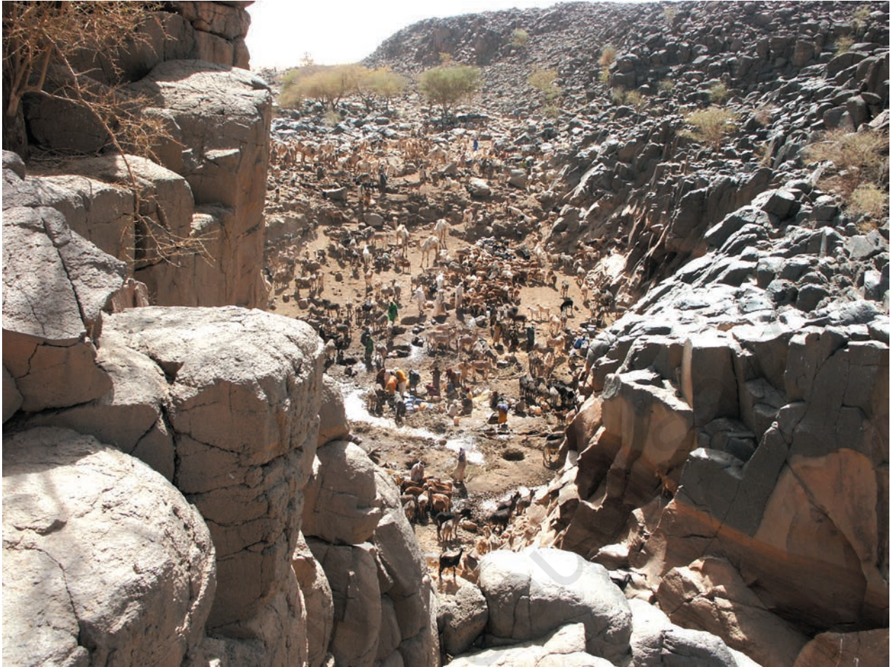
One of the biggest catastrophes in Africa in the 1970s, a drought turned the best cropland in five countries into cracked and barren earth. In fact, the term environmental refugees came into popular vocabulary after this. Many had to flee their homelands as agriculture was no longer possible.

basis of vague scientific evidence and time frames. In that sense the discovery of the ozone hole over the Antarctic in the mid-1980s revealed the opportunity as well as dangers inherent in tackling global environmental problems.