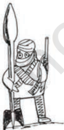
Errorists Loose cannonballs

Toppleton defends freedom and democracy. That's why he is so generous with guns and missiles. Like the ones he gave us to fight the invading Ruffians. He even trained us. We did not realise that it was the oil they were after. Bigoil is always trying to woo us. But we are too busy playing war games. Now we have rules of our own.