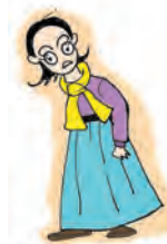
A total of 6 SEZs in China and more than 200 approved SEZs in India! Is this good for India?

Privatisation of agriculture led to a remarkable rise in agricultural production and rural incomes. High personal savings in the rural economy lead to an exponential growth in rural industry. The Chinese economy, including both industry and agriculture, grew at a faster rate. The new trading laws and the creation of Special Economic Zones led to a phenomenal rise in foreign trade. China has become the most important destination for foreign direct investment (FDI) anywhere in the world. It has large foreign exchange reserves that now allow it to make big investment in other countries. China's accession to the