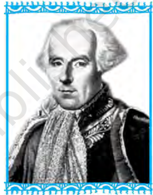
P.S. Laplace (1749-1827)

\frac{a_1}{a_2} \neq \frac{b_1}{b_2} or, a_1 b_2 - a_2 b_1 \neq 0 , then the system of linear equations has a unique solution). The number a_1 b_2 - a_2 b_1