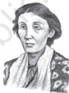
Virginia Woolf 1882-1941

This essay records fleeting impressions and delicate shades of mental experience.