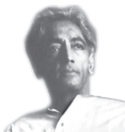
J. Krishnamurti 1895-1986

Jiddu Krishnamurti was a world renowned writer and speaker on fundamental philosophical and spiritual subjects such as the purpose of meditation, human relationships, and how to bring about positive change in global society. His supporters, working through several non-profit foundations, oversee a number of independent schools centred on his views on education, in India, England and the United States. His talks, group and individual discussions, and other writings are published in a variety of formats including print, audio-video as well as online, in many languages.