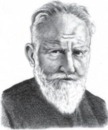
G.B. Shaw 1856-1950

George Bernard Shaw was a dramatist and critic. His work as a London newspaper critic of music and drama resulted in The Quintessence of Ibsenism. His famous plays include Arms and the Man, Candida and Man and Superman. His works present a fearless intellectual criticism, sugar-coated by a pretended lightness of tone. He rebelled against muddled thinking, and sought to puncture hollow pretensions.