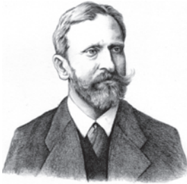
Joseph Conrad 1857-1924

Joseph Conrad, born of Polish parents in the Russian Ukraine, began a seafaring life in 1874. He learnt English at the age of 21, and in 1886 became a British citizen. His famous works include The Nigger of the Narcissus (1898), Lord Jim (1900) and Nostromo (1904). His greatest skill lies in his capacity to evoke an atmosphere through careful attention to detail. He uses the method of story within a story to convey his sense of the inexplicable inner character of life and the shifting quality of the mind. All Conrad's characters suffer from a sense of isolation.