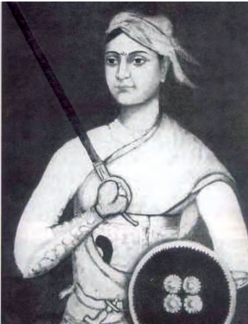
Fig. 10.3 Rani Lakshmi Bai, a popular image