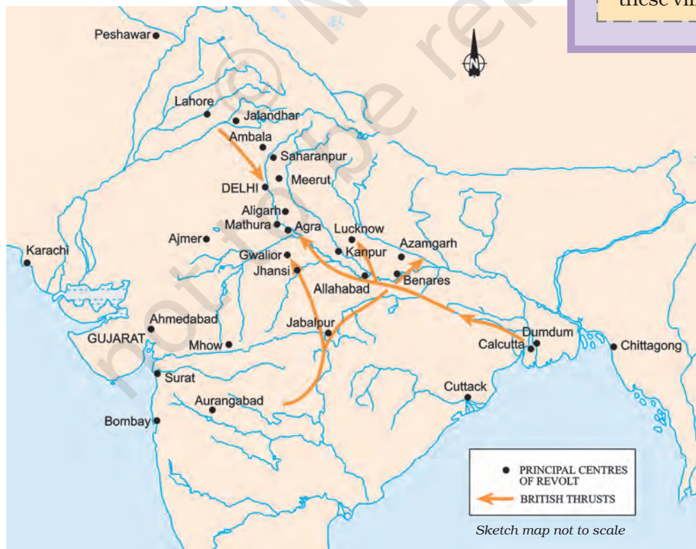
Map 2 The map shows the important centres of revolt and the lines of British attack against the rebels.

➤ What, according to this account, were the problems faced by the British in dealing with these villagers?