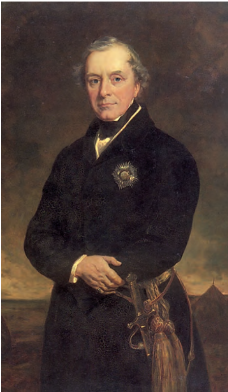
Fig. 10.5 Henry Hardinge, by Francis Grant, 1849

As Governor General, Hardinge attempted to modernise the equipment of the army. The Enfield rifles that were introduced initially used the greased cartridges the sepoys rebelled against.