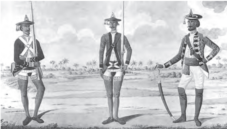
Fig. 10.7 Bengal sepoy in European-style uniform