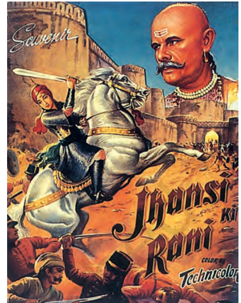
Fig. 10.18 Films and posters have helped create the image of Rani Lakshmi Bai as a masculine warrior

These images did not only reflect the emotions and feelings of the times in which they were produced. They also shaped sensibilities. Fed by the images that circulated in Britain, the public sanctioned the most brutal forms of repression of the rebels. On the other hand, nationalist imageries of the revolt helped shape the nationalist imagination.