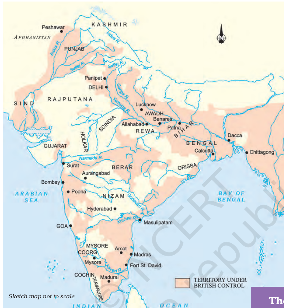
Map 1 Territories under British control in 1857