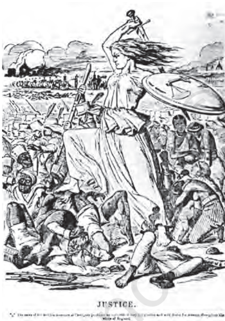
Fig. 10.13 Justice , Punch, 12 September 1857 The caption at the bottom reads “The news of the terrible massacre at Cawnpore (Kanpur) produced an outburst of fiery indignation and wild desire for revenge throughout the whole of England.”

There were innumerable other pictures and cartoons in the British press that sanctioned brutal repression and violent reprisal.