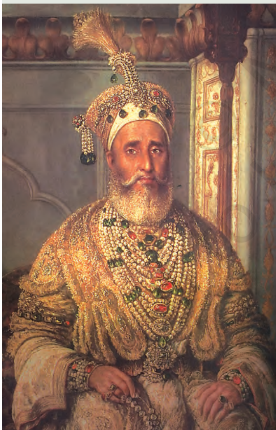
Fig. 10.1 Portrait of Bahadur Shah

Late in the afternoon of 10 May 1857, the sepoys in the cantonment of Meerut broke out in mutiny. It began in the lines of the native infantry, spread very swiftly to the cavalry and then to the city. The ordinary people of the town and surrounding villages joined the sepoys. The sepoys captured the bell of arms where the arms and ammunition were kept and proceeded to attack white people, and to ransack and burn their bungalows and property. Government buildings – the record office, jail, court, post office, treasury, etc. – were destroyed and plundered. The telegraph line to Delhi was cut. As darkness descended, a group of sepoys rode off towards Delhi.