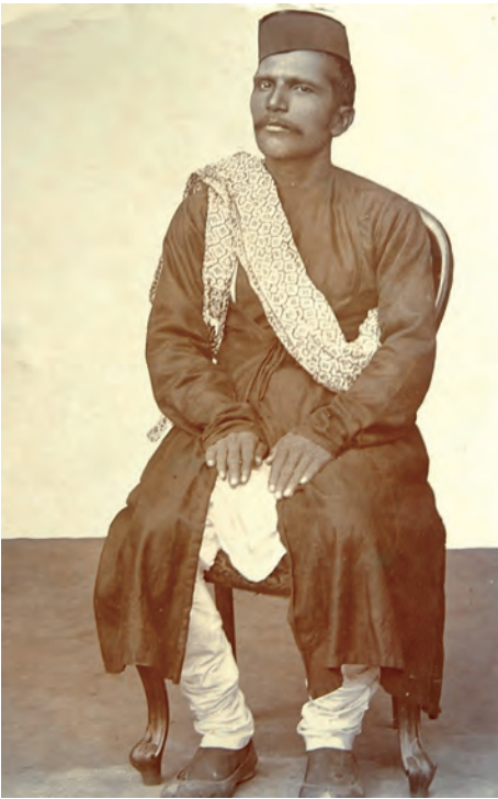
Fig. 10.6 A zamindar from Awadh, 1880

and issues, traditions and loyalties worked themselves out in the revolt of 1857. In Awadh, more than anywhere else, the revolt became an expression of popular resistance to an alien order.