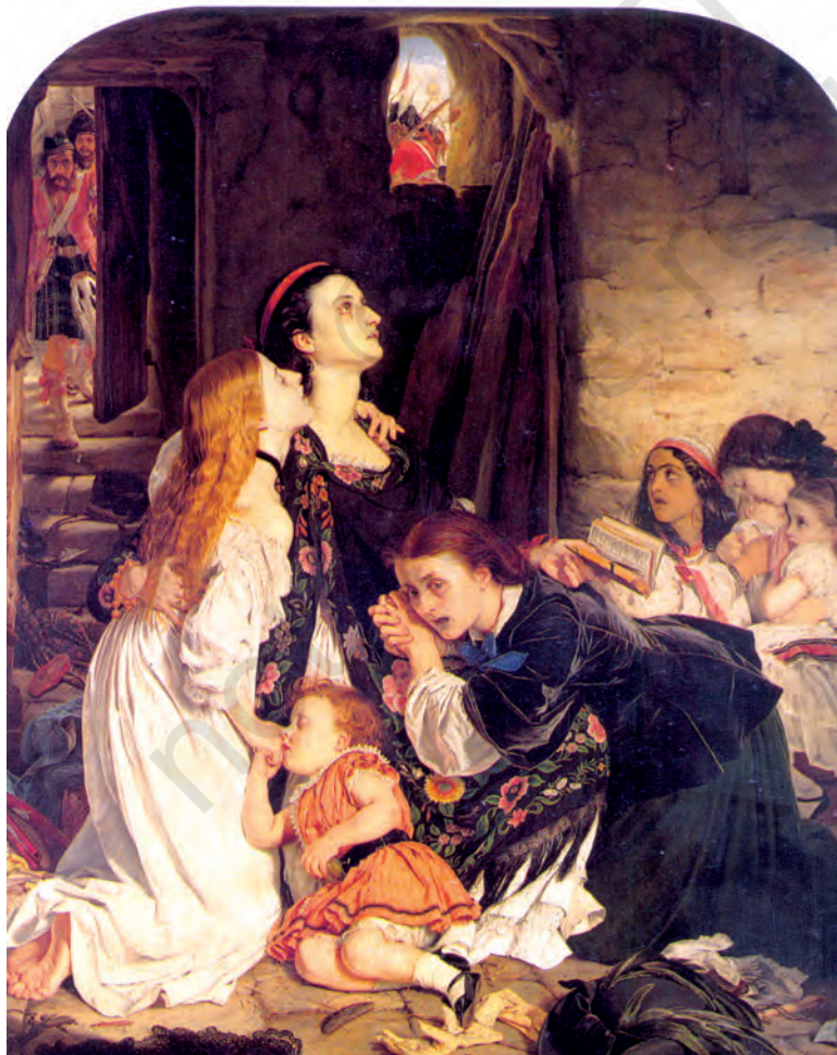
Fig. 10.11 "In Memoriam", by Joseph Noel Paton, 1859

"In Memoriam" (Fig. 10.11) was painted by Joseph Noel Paton two years after the mutiny. You can see English women and children huddled in a circle, looking helpless and innocent, seemingly waiting for the inevitable – dishonour, violence and death. "In Memoriam" does not show gory violence; it only suggests it. It stirs up the spectator's imagination, and seeks to provoke anger and fury. It represents the rebels as violent and brutish, even though they remain invisible in the picture. In the background you can see the British rescue forces arriving as saviours.