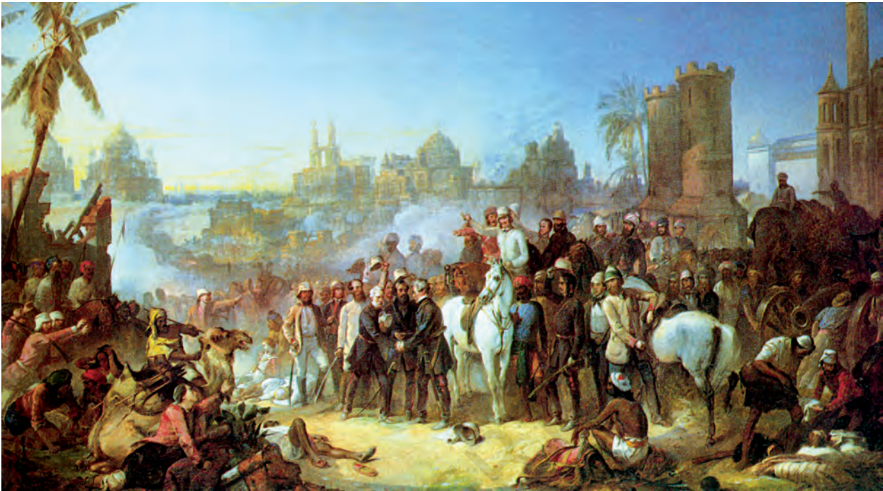
Fig. 10.10 "Relief of Lucknow", painted by Thomas Jones Barker, 1859

was appointed as the new Commander of British forces in India, came with his forces and rescued the besieged British garrison. In British accounts the siege of Lucknow became a story of survival, heroic resistance and the ultimate triumph of British power.