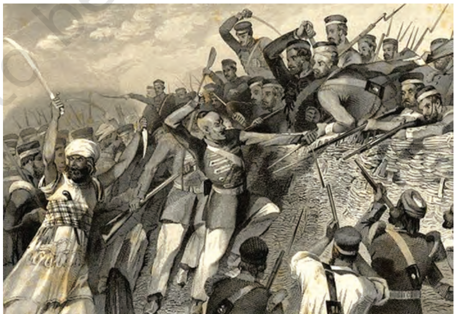
Fig. 10.2 Ordinary people join the sepoys in attacking the British in Lucknow.

Firangi , a term of Persian origin, possibly derived from Frank (from which France gets its name), is used in Urdu and Hindi, often in a derogatory sense, to designate foreigners.