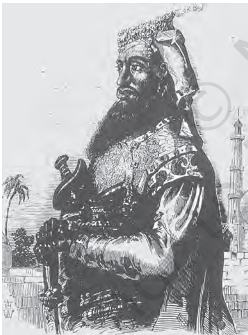
Fig. 10.4 Nana Sahib At the end of 1858, when the rebellion collapsed, Nana Sahib escaped to Nepal. The story of his escape added to the legend of Nana Sahib's courage and valour.