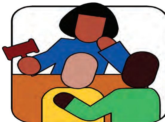
Fig. 20.2: Consumer Protection

The Government of India has accepted, established and enshrined six consumer rights under the Consumer Protection Act (CPA) 1986 . There are four basic rights— (i) right to safety, (ii) right to be informed, (iii) right to choose and (iv) right to be heard. Two additional rights are—right to redressal and right to education.