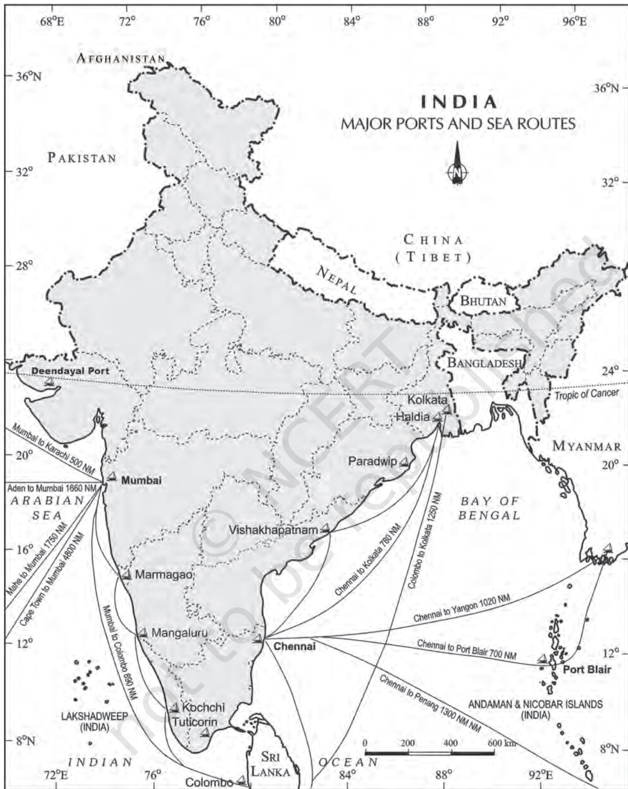
Fig. 8.4 : India – Major Ports and Sea Routes