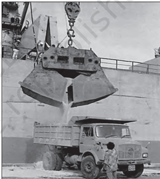
Fig. 8.3 : Unloading of goods on port

India is surrounded by sea from three sides and is bestowed with a long coastline. Water provides a smooth surface for very cheap transport provided there is no turbulence. India