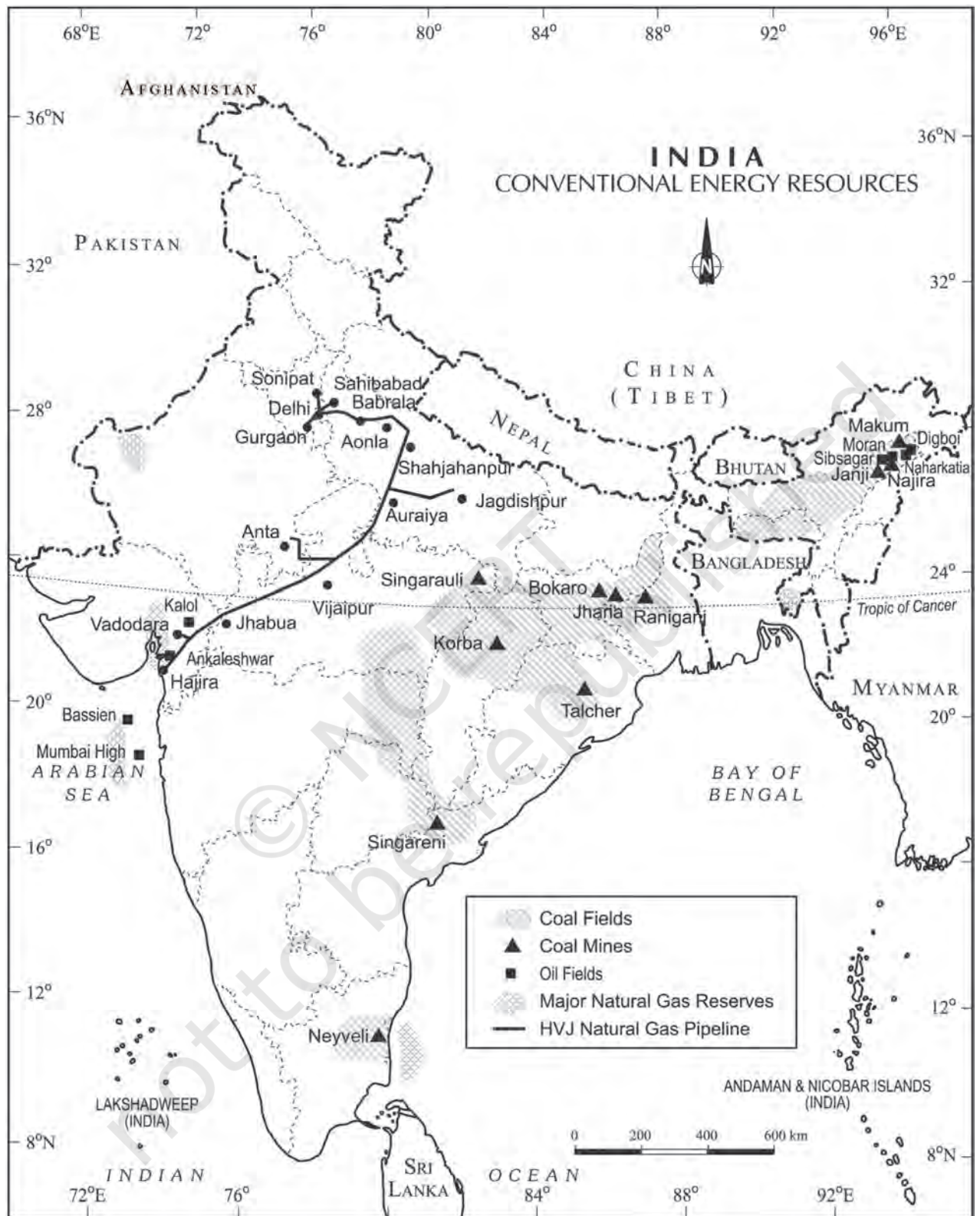
Fig. 5.4 : India – Conventional Energy Resources

Activity: Collect information about cross country natural gas pipelines laid by GAIL (India) under 'One Nation One Grid'.