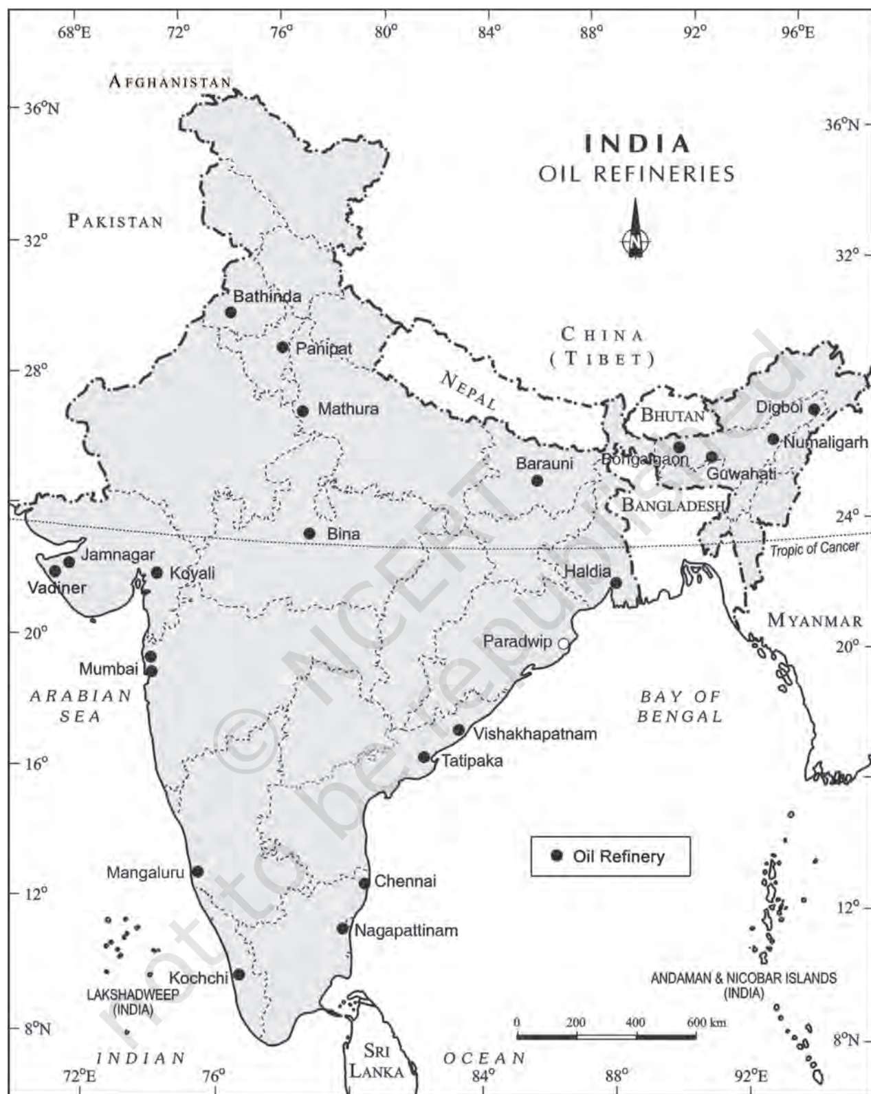
Fig. 5.5 : India – Oil Refineries