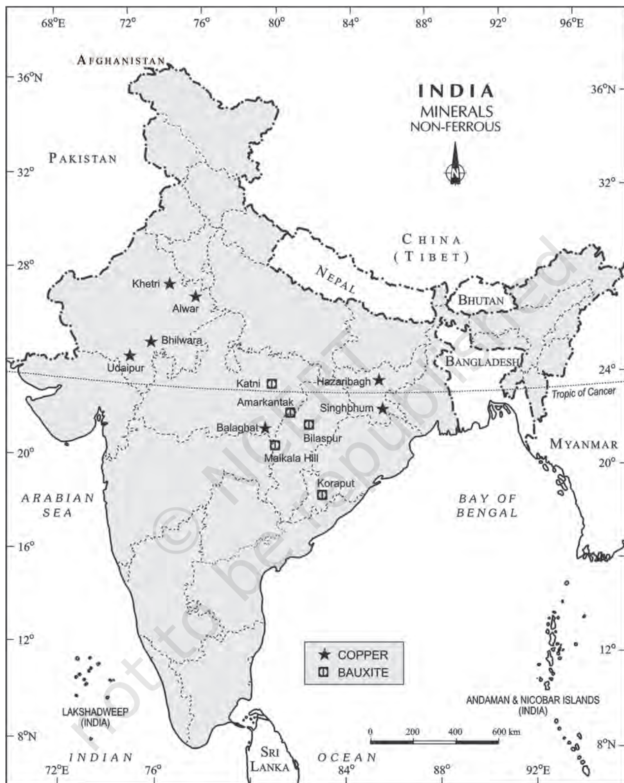
Fig. 5.3 : India – Minerals (Non-Ferrous)