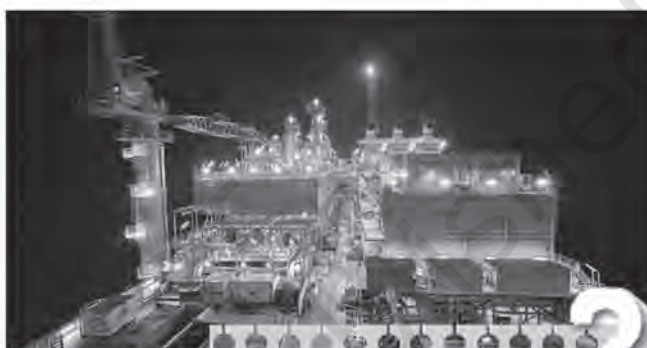
ONGC commencing its first oil production from Krishna coast on January 7.

The block will help increase ONGC's total production of oil and natural gas by 11% and 15% respectively; peak production of the field is expected to be around 45,000 barrels of oil per day and over 10 MMSCMD of gas