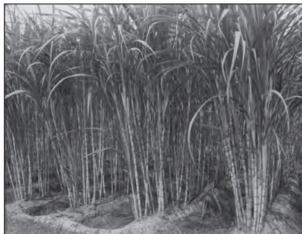
Fig. 3.8 : Sugarcane Cultivation

Sugarcane is a crop of tropical areas. Under rainfed conditions, it is cultivated in sub-humid and humid climates. But it is largely an irrigated crop in India. In Indo-Gangetic plain, its cultivation is largely concentrated in Uttar Pradesh. Sugarcane growing area in western India is spread over Maharashtra and Gujarat.