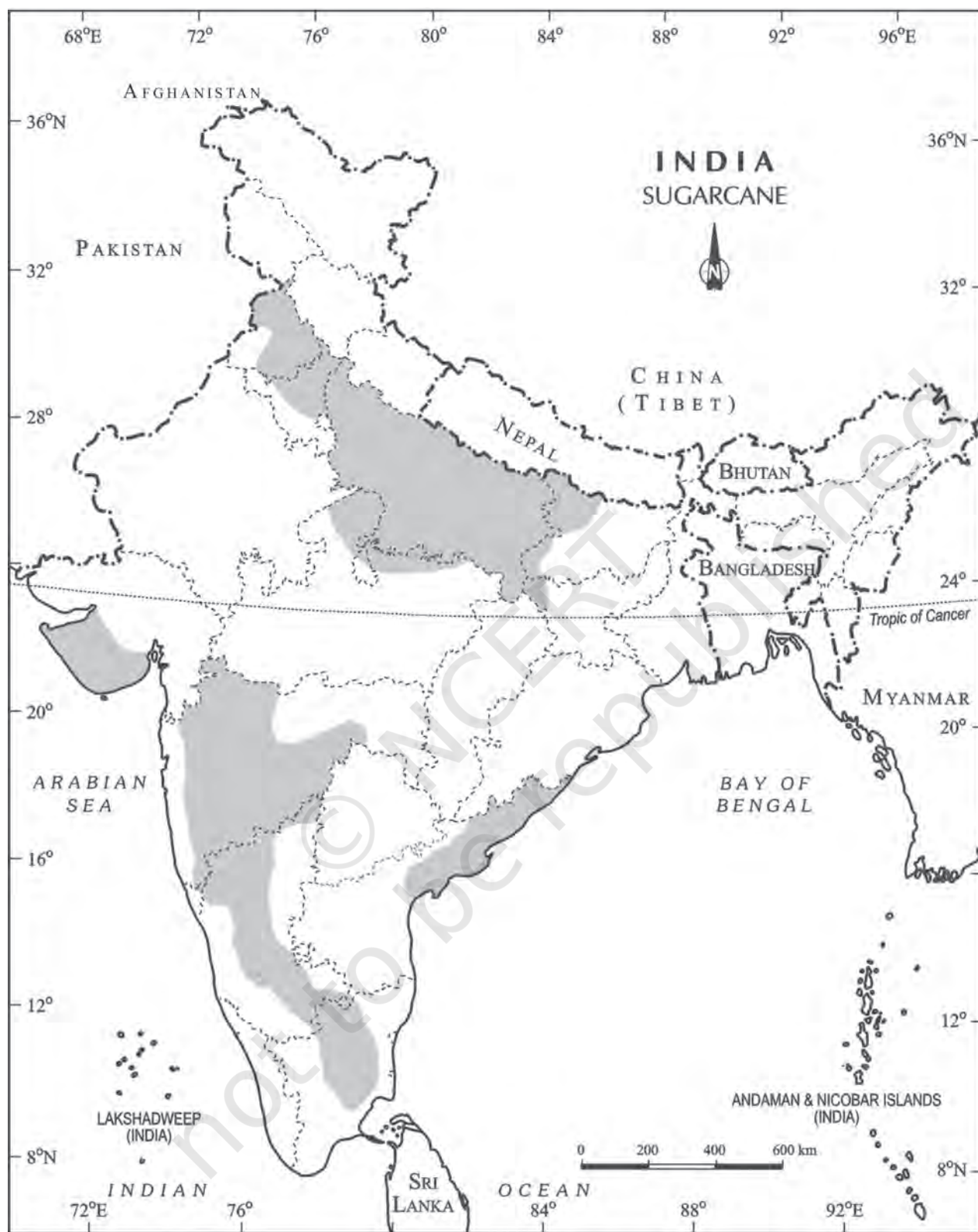
Fig. 3.9 : India – Distribution of Sugarcane