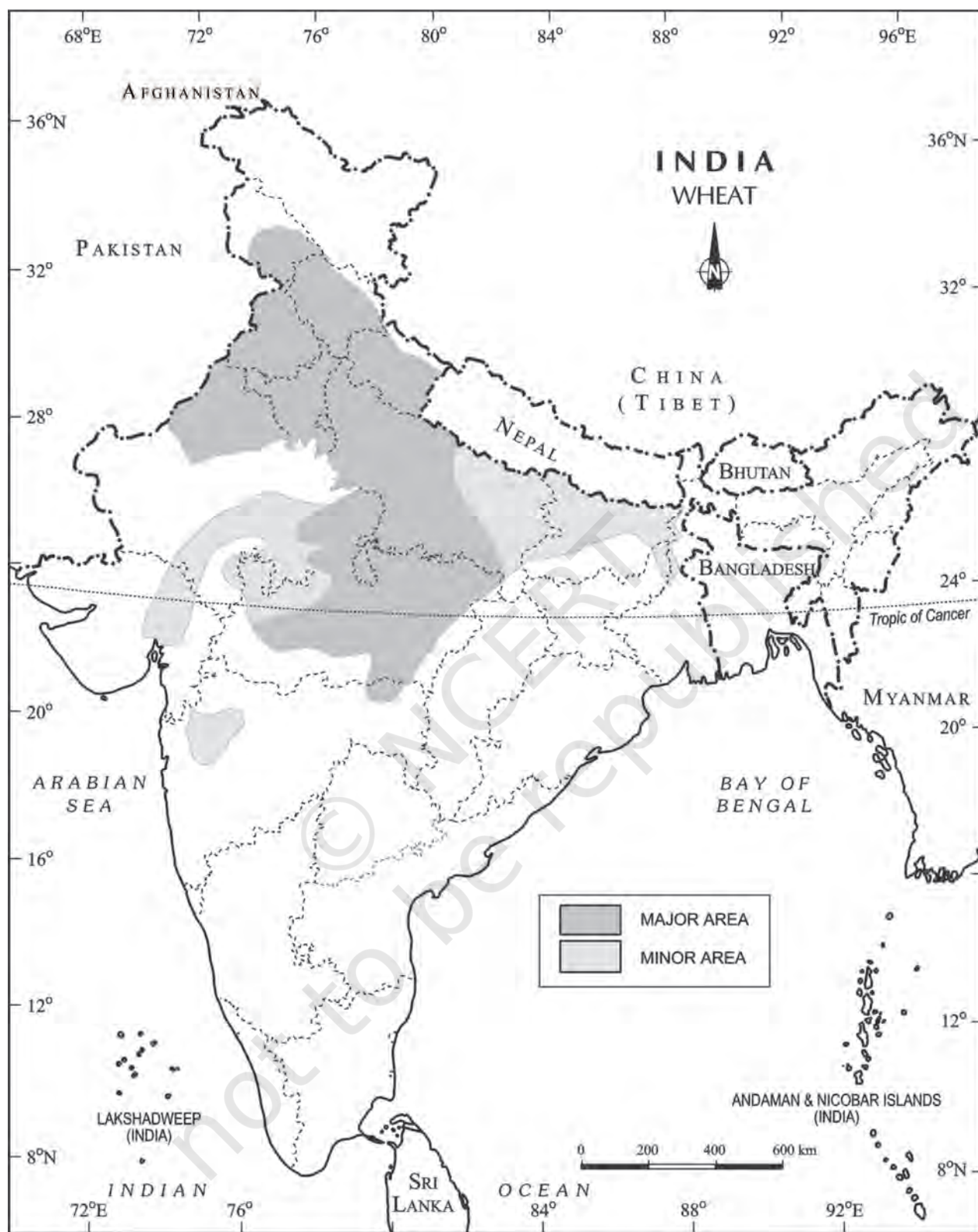
Fig. 3.4 : India – Distribution of Wheat