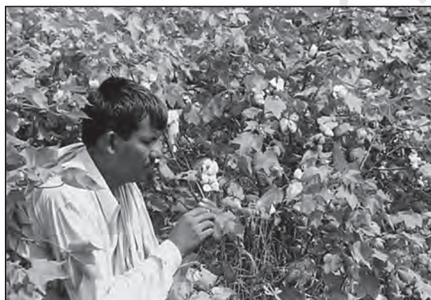
Fig. 3.7 : Cotton Cultivation

Cotton is a tropical crop grown in kharif season in semi-arid areas of the country. India lost a large proportion of cotton growing area to Pakistan during partition. However, its acreage has increased considerably during the last 50 years. India grows both short staple (Indian) cotton as well as long staple (American) cotton called ' narma ' in north-western parts of the country. Cotton requires clear sky during flowering stage.