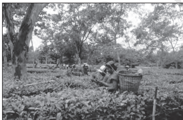
Fig. 3.10 : Tea Farming

Tea is a plantation crop used as beverage. Black tea leaves are fermented whereas green tea leaves are unfermented. Tea leaves have rich content of caffeine and tannin. It is an indigenous crop of hills in northern China. It is grown over undulating topography of hilly areas and well-drained soils in humid and sub-humid tropics and sub-tropics. In India, tea plantation started in 1840s in Brahmaputra valley of Assam which still is a major tea growing area in the country. Later on, its plantation was introduced in the sub-Himalayan region of West Bengal (Darjeeling, Jalpaiguri and Cooch Behar districts). Tea is also cultivated on the lower slopes of Nilgiri and