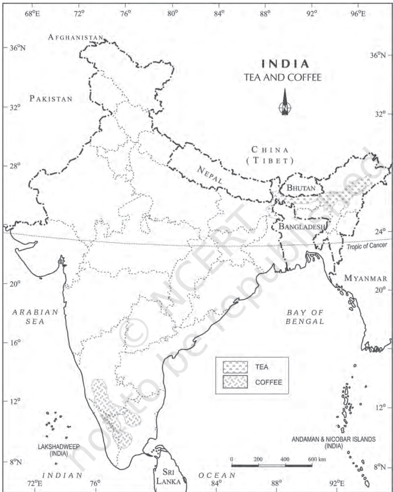
Fig. 3.11 : India – Distribution of Tea and Coffee