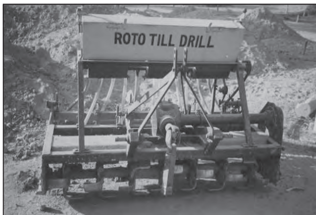
Fig. 3.12 : Roto Till Drill—A modern agricultural equipment