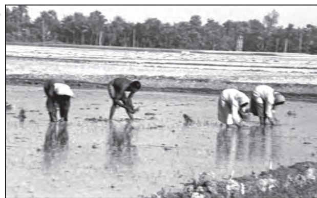
Fig. 3.2 : Rice transplantation in southern parts of India

India contributes 22.07 per cent of rice production in the world and ranked second after China in 2018. About one-fourth of the total cropped area in the country is under rice cultivation. West Bengal, Uttar Pradesh, and Punjab are the leading rice producing states in the country. The yield level of rice is high in Punjab, Tamil Nadu, Haryana, Andhra Pradesh, Telangana, West Bengal and Kerala. In the first four of these states almost the entire land under rice cultivation is irrigated. Punjab and Haryana are not traditional rice growing areas. Rice