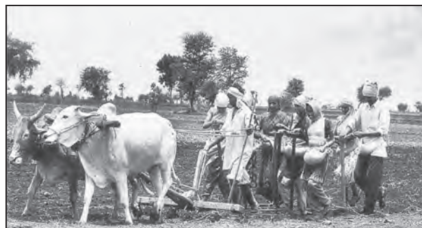
Fig. 3.5 : Farmers sowing soyabean seeds in Amravati, Maharashtra

Soyabean and sunflower are other important oilseeds grown in India. Soyabean is mostly grown in Madhya Pradesh and Maharashtra.