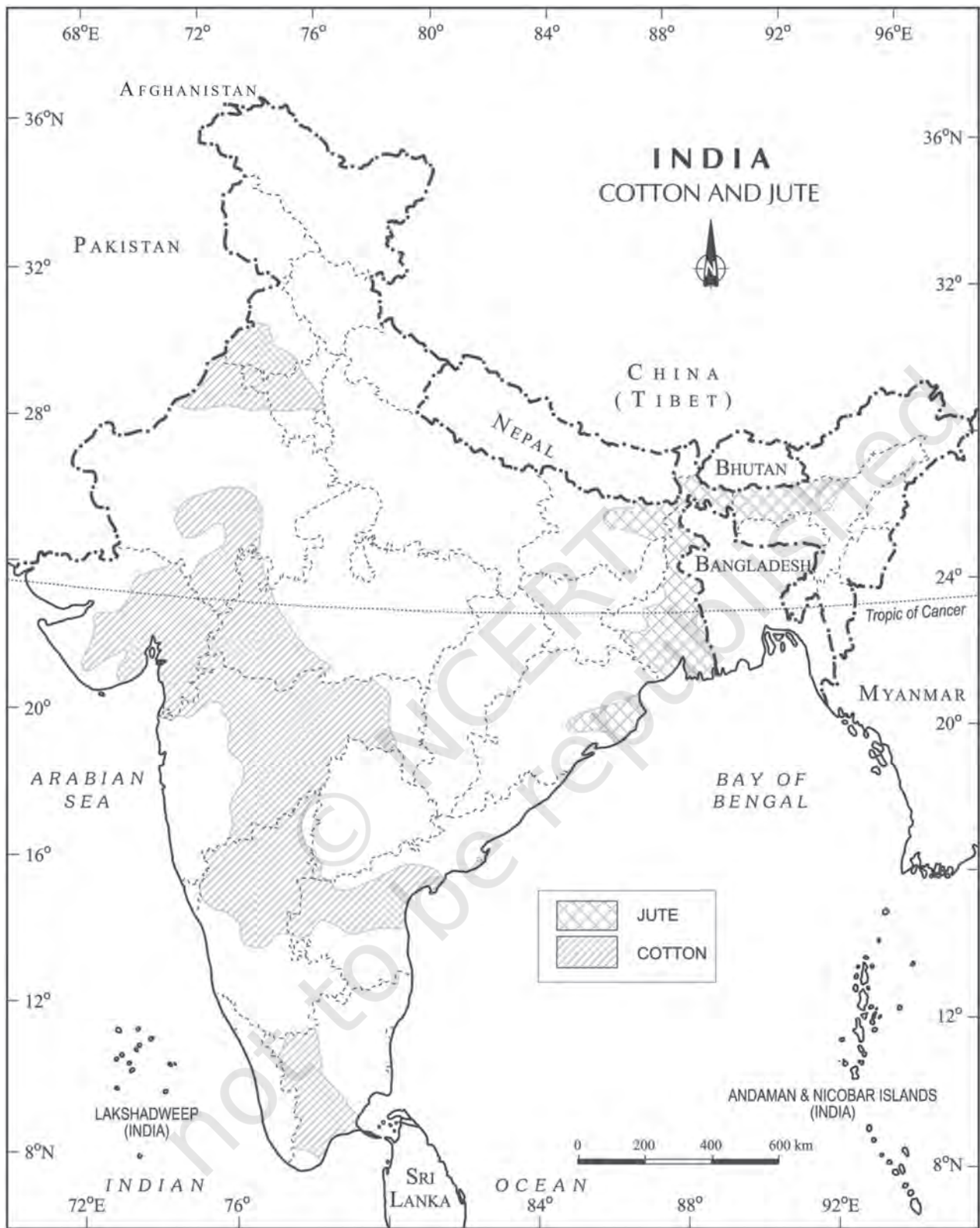
Fig. 3.6 : India – Distribution of Cotton and Jute