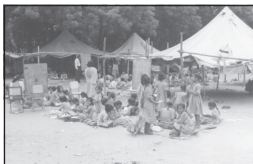
Discuss the visuals (Two types of schools)