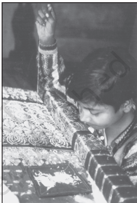
Discuss the visual

The report indicates how gender and caste discrimination impinge upon the chances of education. Recall how we began this book in Chapter 1 about a child's chances for a good job