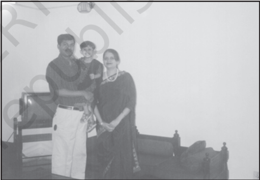
Notice how families and residences are different