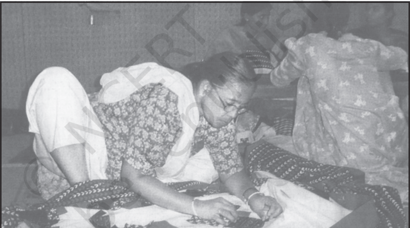
Different Types of Work

physical effort, which has as its objective the production of goods and services that cater to human needs.