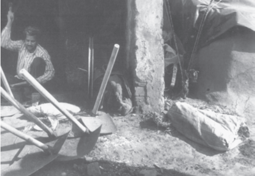
Work and Home