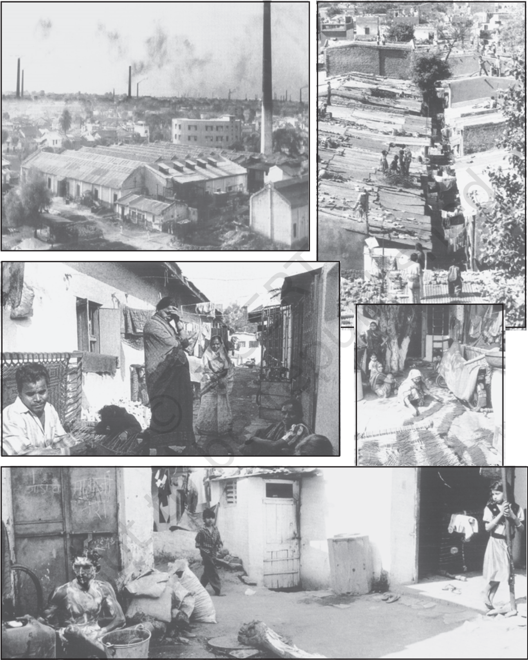
From working class neighbourhoods to slum localities