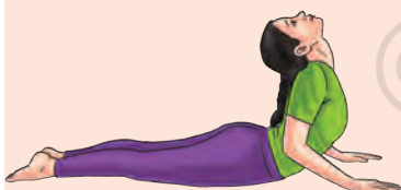
Prone Posture: Bhujangāsana