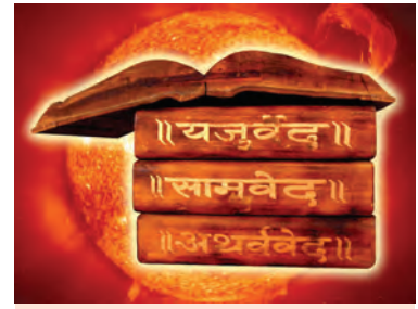
Script from Vedas

In the pre-classical era, Yoga was an incoherent mixture of various ideas and techniques that often contradicted each other. The classical period is defined by Maharshi Patanjali's yoga sutras , the first systematic presentation of Yoga. After Patanjali, many sages and Yoga masters contributed greatly for the preservation and development of the field through their well-documented practices and literature. The period between 500 B.C.–A.D. 800 is considered as the Classical period, which is also considered