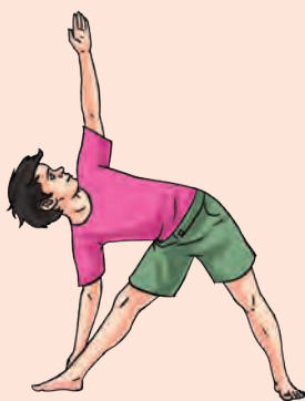
Standing Posture: Trikoṇāsana