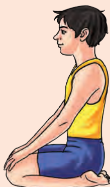
Sitting Posture: Vajrāsana