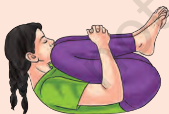
Supine Posture: Pawanamuktāsana