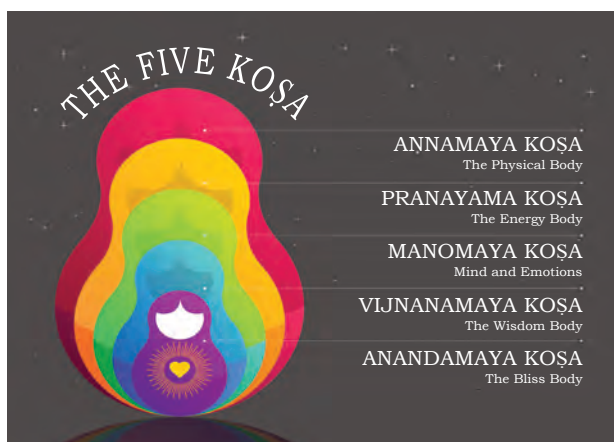
Depicting a gross body of human being showing layers of existence.