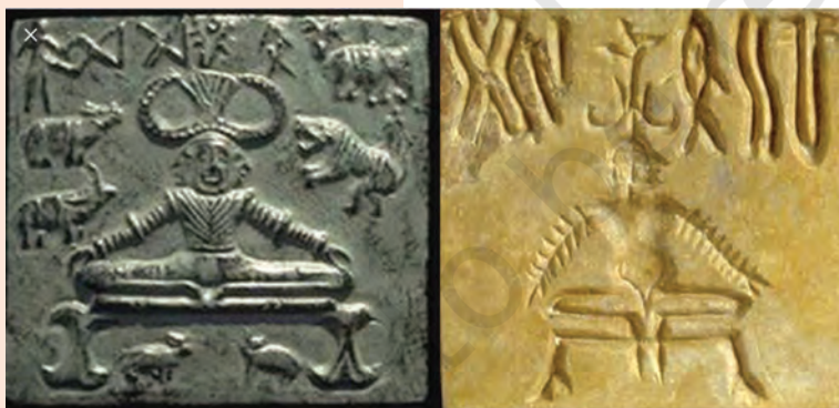
Carving on Stones of Yoga Mudrā During Indus Valley Civilisation