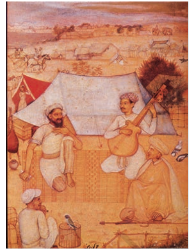
Musician: Mughal Painting of 17th Century

In the Bhakti movement, literature and music played a major role in propagating philosophies of human life. The works of composers like Jayadeva (eleventh century), Vidyapati (A.D. 1375), Chandidas (fourteenth to fifteenth century), Bhakta Narasimha (A.D. 1416–1475) and Meerabai (A.D. 1555–1603), Kabir and Tulsidas (fourteenth and fifteenth century), Surdas, Vallabhacharya and Chaitanya (seventeenth century) had a very strong impact on music traditions and practices during this period.