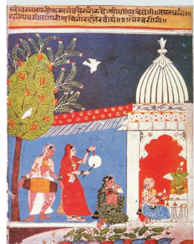
Raag Mala Chitra: Bhairvi

Bharat's Nāṭyaśāstra is the most important and pioneer work of music, dance and drama. It has 36 chapters, out of which six chapters (28th–33rd) are related to music. Śruti , Grāma , Grāmarāgas , Jāti , Mūrchanā , Gīti , Alaṅkāra , etc., have been discussed in depth in the book. Dhruva Gīta had a special place in Nāṭya . These were used in between different scenes called Nāṭya Sandhis . Concept of Rasa for aesthetic experience has also been discussed elaborately in Nāṭyaśāstra . This is the first text available on the classification of Indian Instruments.