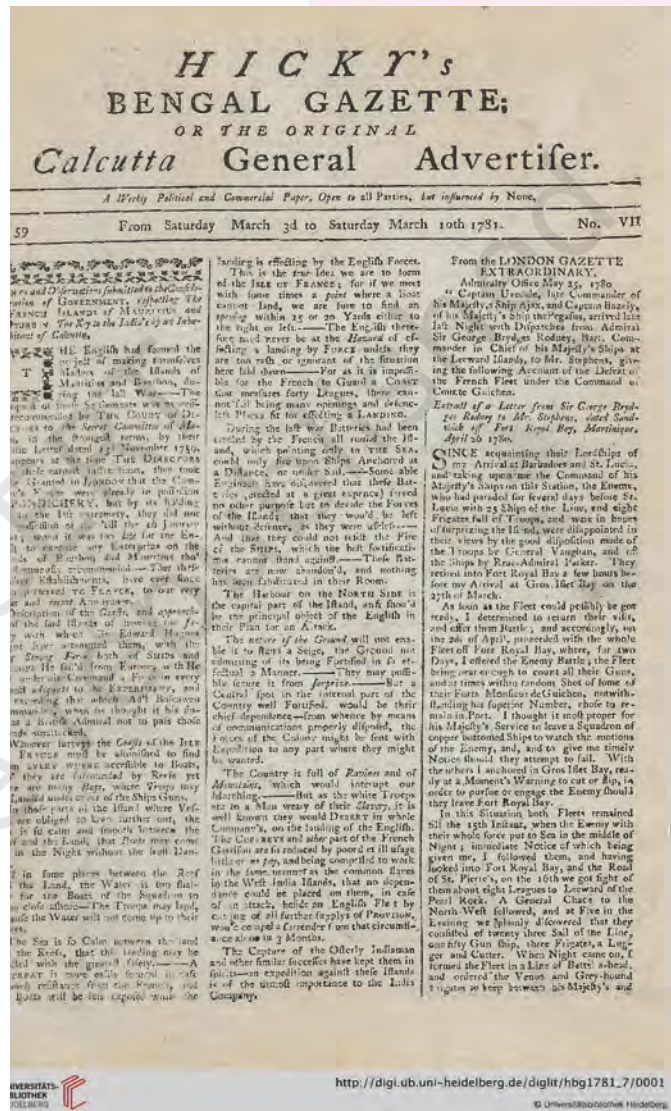
Front page of Hicky's Bengal Gazette, 10 March 1781, from the University of Heidelberg's archives

Literature in different languages sustained the spirit of struggle for freedom from British rule. It became the social responsibility of the writers to write with a purpose of awakening people to ideas of justice, and freedom from slavery. Bankimchandra Chattopadhyaya (1838–94) brought out a magazine Bangadarshan to educate people on social and political issues of the time. Kavivachansudha by Bharatendu Harish Chandra (1850–85) became the voice against the atrocities of prevailing authority. Bharatendu's songs for Prabhat Pheris and songs were sung with fervour. Another important development was Bengal Gazette , the first newspaper in India and Asia as well. It was founded by James Augustus Hicky, who visualised the newspaper as a forum for people to voice their opinion. He was sarcastic and critical of the events and policies of the British rulers. It was said that Bengal Gazette made people's lives easier; instead of writing long letters to their friends and relatives, they sent copies of the newspaper.