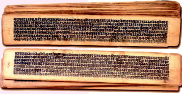
Rgveda (padapāṭha) manuscript in Devanagari, early 19th century