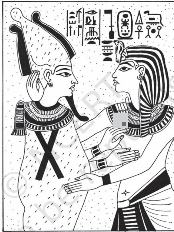
Mural in King Tut's tomb showing King Tut with Osiris, the god of the afterlife

of pixels, and the technician spun and tilted it in every direction. Neck vertebrae appeared as clearly as in an anatomy class. Other images revealed a hand, several views of the rib cage, and a transection of the skull. But for now the pressure was off. Sitting back in his chair, Zahi Hawass smiled, visibly relieved that nothing had gone seriously wrong. "I didn't sleep last night, not for a second," he said. "I was so worried. But now I think I will go and sleep."