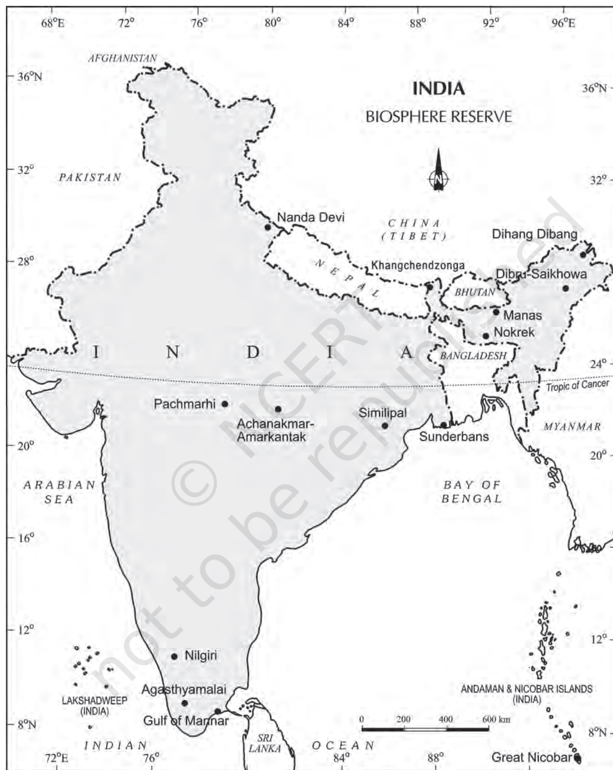
Figure 5.8 : India : Biosphere Reserves