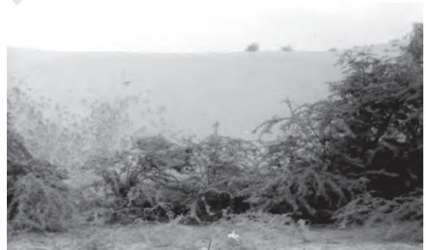
Figure 5.4 : Tropical Thorn Forests

Tropical thorn forests occur in the areas which receive rainfall less than 50 cm. These consist of a variety of grasses and shrubs. It includes semi-arid areas of south west Punjab, Haryana, Rajasthan, Gujarat, Madhya Pradesh and Uttar Pradesh. In these forests, plants remain leafless for most part of the year and give an expression of scrub vegetation. Important species found are babool , ber , and wild date palm, khair , neem , khejri , palas , etc. Tussocky grass grows upto a height of 2 m as the under growth.