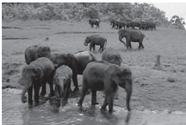
Figure 5.7 : Elephants in their Natural Habitat

For the purpose of effective conservation of flora and fauna, special steps have been initiated by the Government of India in