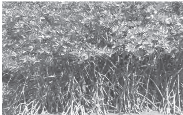
Figure 5.6 : Mangrove Forests

They consist of a number of salt-tolerant species of plants. Crisscrossed by creeks of stagnant water and tidal flows, these forests give shelter to a wide variety of birds.