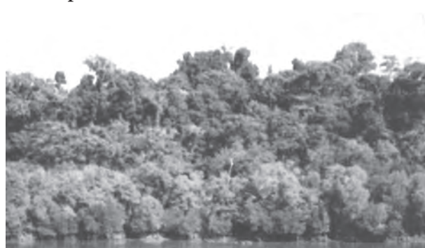
Figure 5.1 : Evergreen Forest

The semi evergreen forests are found in the less rainy parts of these regions. Such forests have a mixture of evergreen and moist deciduous trees. The undergrowing climbers provide an evergreen character to these forests. Main species are white cedar, hollock and kail.