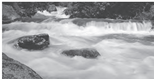
Figure 3.3 : Rapids

The Himalayan drainage system has evolved through a long geological history. It mainly includes the Ganga, the Indus and the Brahmaputra river basins. Since these are fed both by melting of snow and precipitation, rivers of this system are perennial. These rivers pass through the giant gorges carved out by the erosional activity carried on simultaneously with the uplift of the Himalayas. Besides deep gorges, these rivers also form V-shaped valleys, rapids and waterfalls in their mountainous