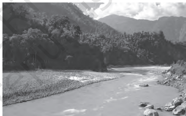
Figure 3.1 : A River in the Mountainous Region

Do you have a river near your village or city? Have you ever been there for boating or bathing? Is it perennial (always with water) or ephemeral (water during rainy season, and dry, otherwise)? Do you know that rivers flow in the same direction? You have studied about slopes in the other two textbooks of geography (NCERT, 2006) in this class . Can you, then, explain the reason for water flowing from one direction to the other? Why do the rivers originating from the Himalayas in the northern India and the Western Ghats in the southern India flow towards the east and discharge their waters in the Bay of Bengal?