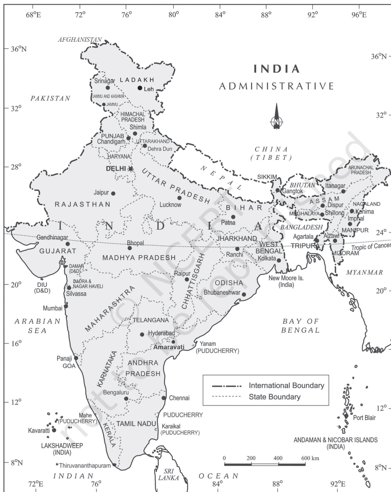
Figure 1.1 : India : Administrative Divisions