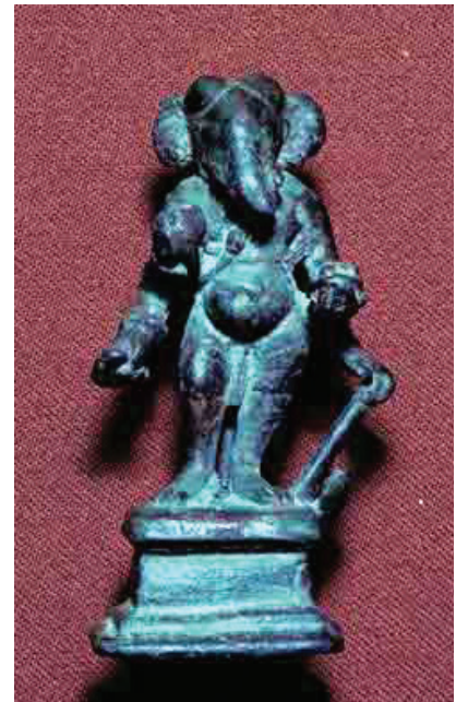
Ganesh, seventh century CE, Kashmir