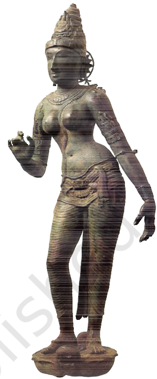
Devi, Chola bronze, Tamil Nadu

Vakataka bronze images of the Buddha from Phophnar, Maharashtra, are contemporary with the Gupta period bronzes. They show the influence of the Amaravati style of