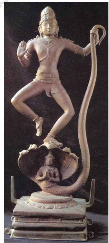
Kaliyadaman, Chola bronze, Tamil Nadu

Gujarat and Rajasthan have been strongholds of Jainism since early times. A famous hoard of Jain bronzes was found at Akota, on the outskirts of Baroda, dated between