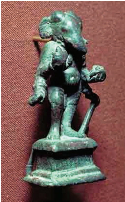
Ganesh, Kashmir, seventh century CE

Andhra Pradesh in the third century CE and at the same time there is a significant change in the draping style of the monk's robe. Buddha's right hand in abhaya mudra is free so that the drapery clings to the right side of the body contour. The result is a continuous flowing line on this side of the figure. At the level of the ankles of the Buddha figure the drapery makes a conspicuous curvilinear turn, as it is held by the left hand.