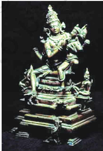
Shiva Family, tenth century CE, Bihar

Many standing Buddha images with right hand in abhaya mudra were cast in North India, particularly Uttar Pradesh and Bihar, during the Gupta and Post-Gupta periods, i.e., between the fifth, sixth and seventh centuries. The sanghati or the monk's robe is wrapped to cover the shoulders which turns over the right arm, while the other