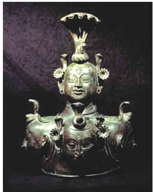
Bronze sculpture, Himachal Pradesh

A noteworthy development is the growth of different types of iconography of Vishnu images. Four-headed Vishnu, also known as Chaturanana or Vaikuntha Vishnu , was worshipped in these regions. While the central face represents Vasudeva,