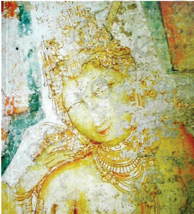
Devi — seventh century CE, Panamalai

On the pillars of the veranda are seen dancing figures of celestial nymphs. The contours of figures are firmly drawn and painted in vermilion red on a lighter background. The body is rendered in yellow with subtle modelling. Supple limbs, expression on the faces of dancers, rhythm in their swaying movement, all speak of the artists' skill in creative imagination in visualising the forms in