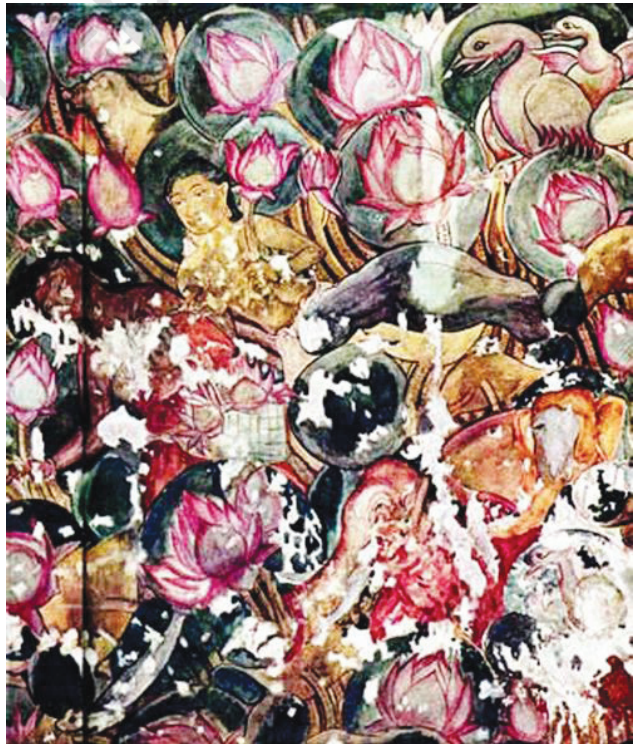
Sittanvasal — early Pandya period, ninth century CE