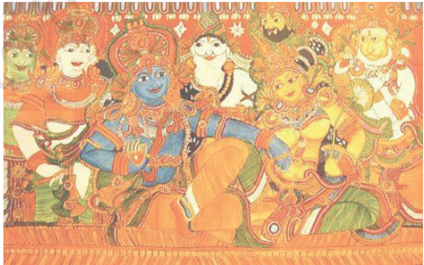
Venugopal, Sri Rama Temple, Triprayar

Kerala painters (during the period from the sixteenth to the eighteenth century) evolved a pictorial language and technique of their own while discriminately adopting certain stylistic elements from Nayaka and Vijayanagara schools. The painters evolved a language taking cues from contemporary traditions, like Kathakali and kalam ezhuthu