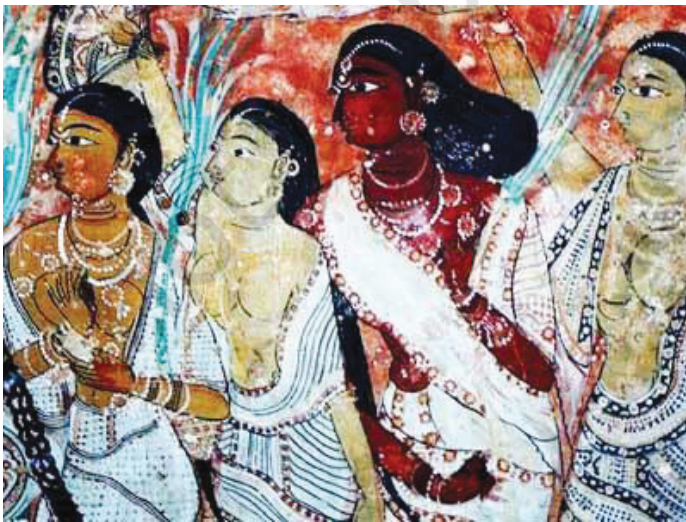
Ladies attending Parvati, Virbhadr Temple, Lepakshi

Paintings of the Nayaka dynasty in the seventeenth and eighteenth centuries are seen in Thiruparakunram,