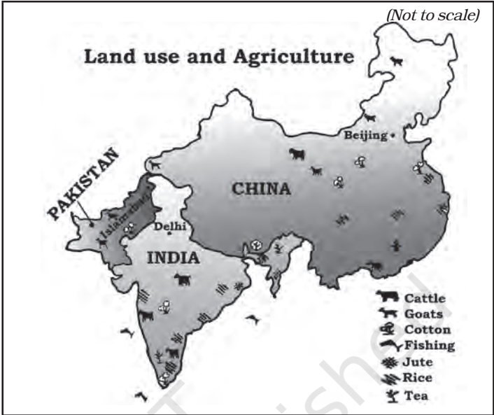
Fig. 8.2 Land use and agriculture in India, China and Pakistan

When many developed countries were finding it difficult to maintain a growth rate of even 5 per cent, China was able to maintain near double-digit growth during 1980s as can be seen from Table 8.2. Also, notice that in the 1980s, Pakistan was ahead of India; China was having double-digit growth and India was at the bottom. In 2015–17 and 2024, there has been a decline in