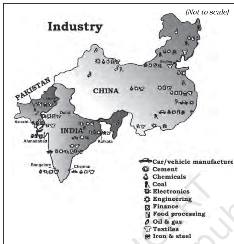
Fig. 8.3 Industry in India, China and Pakistan

Pakistan have more proportion of urban population than India. In China, due to topographic and climatic conditions, the area suitable for cultivation is relatively small — only about 10 per cent of its total land area. The total cultivable area in China accounts for 40 per cent of the cultivable area in India. Until the 1980s, more than 80 per cent of the people in China were dependent on farming as their sole source of livelihood. Since then, the government encouraged people to leave their fields and pursue other activities such as handicrafts, commerce and transport. In 2021,