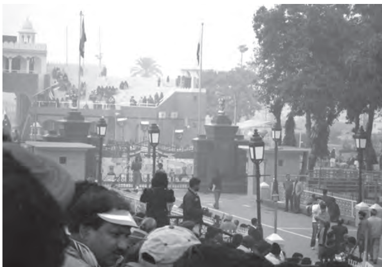
Fig. 8.1 Wagah Border is not only a tourist place but also used for trade between India and Pakistan

goods. At this stage, enterprises owned by government (known as State Owned Enterprises—SOEs), which we, in India, call public sector enterprises, were made to face competition. The reform process also involved dual pricing. This means fixing the prices in two ways; farmers and industrial units were required to buy and sell fixed quantities of inputs and outputs on the basis of prices fixed by the government and the rest were purchased and sold at market prices. Over the years, as production increased, the proportion of goods or inputs transacted in the market also increased. In order to attract foreign investors, special economic zones were set up.