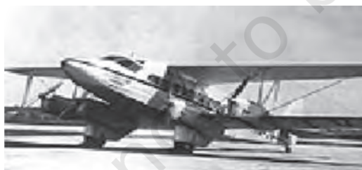
Fig.1.5 Tata Airlines, a division of Tata and Sons, was established in 1932 inaugurating the aviation sector in India

➤ There is a perception still going around that in many ways the British administration in India was quite beneficial. This perception needs an informed debate. How would you look at this perception? Argue this out in your class—'Was the British Raj good for India'?