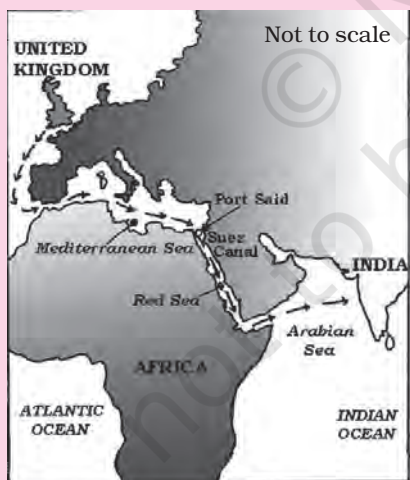
Fig.1.2 Suez Canal: Used as highway between India and Britain

Various details about the population of British India were first collected through a census in 1881. Though suffering from certain limitations, it revealed the unevenness in India's population growth. Subsequently,