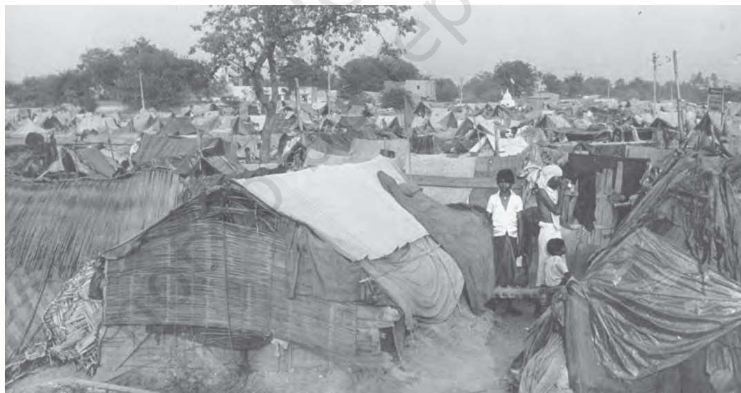
Fig. 1.3 A large section of India's population did not have basic needs such as housing

During the colonial period, the occupational structure of India, i.e., distribution of working persons across different industries and sectors, showed little sign of change. The agricultural sector accounted for