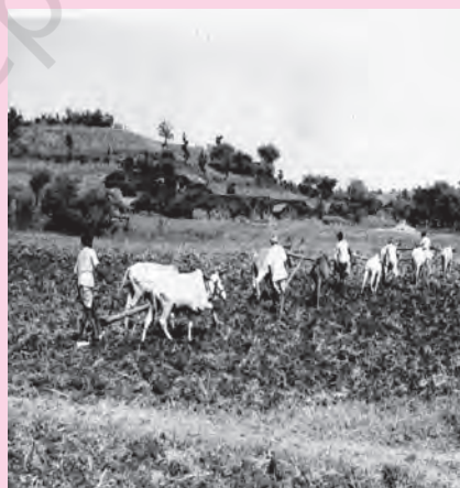
Fig. 1.1 India's agricultural stagnation under the British colonial rule

The French traveller, Bernier, described seventeenth century Bengal in the following way: "The knowledge I have acquired of Bengal in two visits inclines me to believe that it is richer than Egypt. It exports, in abundance, cottons and silks, rice, sugar and butter. It produces amply — for its own consumption — wheat, vegetables, grains, fowls, ducks and geese. It has immense herds of pigs and flocks of sheep and goats. Fish of every kind it has in profusion. From rajmahal to the sea is an endless number of canals, cut in bygone ages from the Ganges by immense labour for navigation and irrigation."