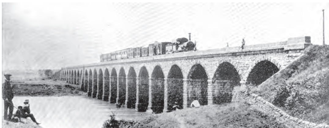
Fig. 1.4 First Railway Bridge linking Bombay with Thane, 1854

Indian people gained owing to the introduction of the railways, were thus outweighed by the country's huge economic loss.