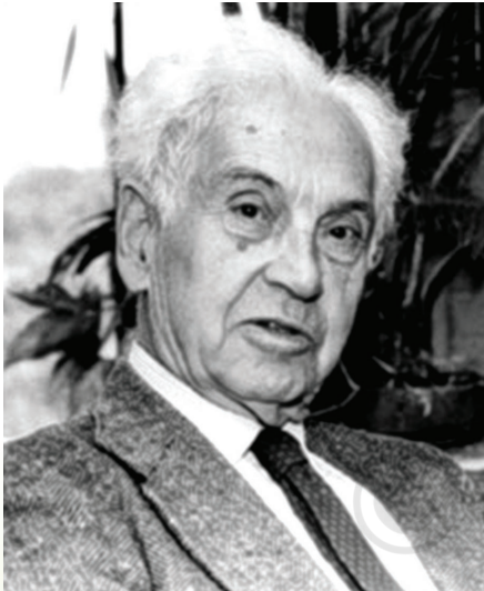
Ernst Mayr (1904 – 2004)

Born on 5 July 1904, in Kempten, Germany, ERNST MAYR, the Harvard University evolutionary biologist who has been called 'The Darwin of the 20 th century', was one of the 100 greatest scientists of all time. Mayr joined Harvard's Faculty of Arts and Sciences in 1953 and retired in 1975, assuming the title Alexander Agassiz Professor of Zoology Emeritus . Throughout his nearly 80-year career, his research spanned ornithology, taxonomy, zoogeography, evolution, systematics, and the history and philosophy of biology. He almost single-handedly made the origin of species diversity the central question of evolutionary biology that it is today. He also pioneered the currently accepted definition of a biological species. Mayr was awarded the three prizes widely regarded as the triple crown of biology: the Balzan Prize in 1983, the International Prize for Biology in 1994, and the Crafoord Prize in 1999. Mayr died at the age of 100 in the year 2004.