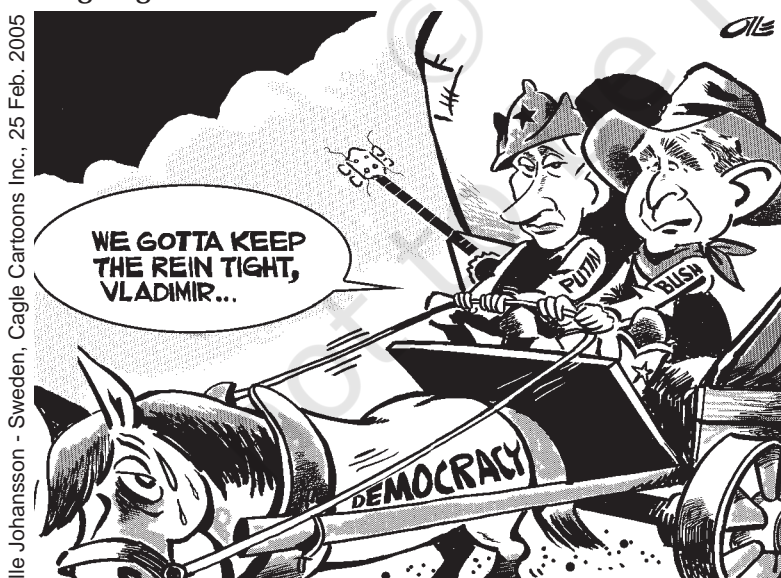
Reigning the Reins

© Olle Johansson - Sweden, Cagle Cartoons Inc., 25 Feb. 2005