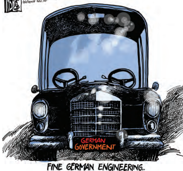
© Tab - The Calgary Sun, Cagle Cartoons Inc.

The cartoon at the left refers to the problems of running the Germany's grand coalition government that includes the two major parties of the country, namely the Christian Democratic Union and the Social Democratic Party. The two parties are historically rivals to each other. They had to form a coalition government because neither of them got clear majority of seats on their own in the 2005 elections. They take divergent positions on several policy matters, but still jointly run the government.