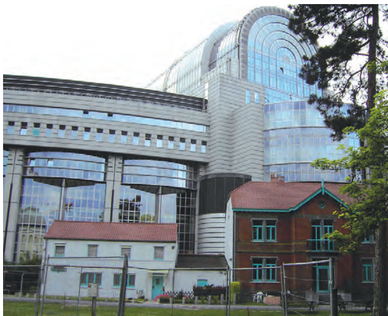
European Parliament in Brussels, Belgium

You might find the Belgian model very complicated. It indeed is very complicated, even for people living in Belgium. But these arrangements have worked well so far. They helped to avoid civic strife between the two major communities and a possible division of the country on linguistic lines. When many countries of