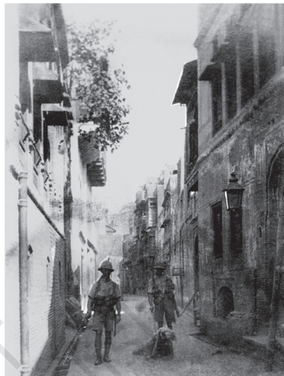
Fig. 3 – General Dyer's 'crawling orders' being administered by British soldiers, Amritsar, Punjab, 1919.

While the Rowlatt satyagraha had been a widespread movement, it was still limited mostly to cities and towns. Mahatma Gandhi now felt the need to launch a more broad-based movement in India. But he was certain that no such movement could be organised without bringing the Hindus and Muslims closer together. One way of doing this, he felt, was to take up the Khilafat issue. The First World War had ended with the defeat of Ottoman Turkey. And there were rumours that a harsh peace treaty was going to be imposed on the Ottoman emperor – the spiritual head of the Islamic world (the Khalifa). To defend the Khalifa's temporal powers, a Khilafat Committee was formed in Bombay in March 1919. A young generation of Muslim leaders like the brothers Muhammad Ali and Shaukat Ali, began discussing with Mahatma Gandhi about the possibility of a united mass action on the issue. Gandhiji saw this as an opportunity to bring Muslims under the umbrella of a unified national movement. At the Calcutta session of the Congress in September 1920, he convinced other leaders of the need to start a non-cooperation movement in support of Khilafat as well as for swaraj.