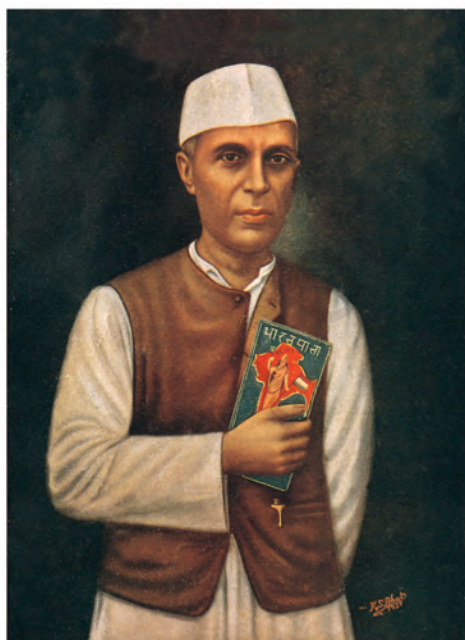
Fig. 13 – Jawaharlal Nehru, a popular print.

Notice that the mother figure here is shown as dispensing learning, food and clothing. The mala in one hand emphasises her ascetic quality. Abanindranath Tagore, like Ravi Varma before him, tried to develop a style of painting that could be seen as truly Indian.