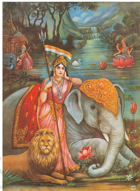
Fig. 14a – Bharat Mata.

These efforts to unify people were not without problems. When the past being glorified was Hindu, when the images celebrated were drawn from Hindu iconography, then people of other communities felt left out.