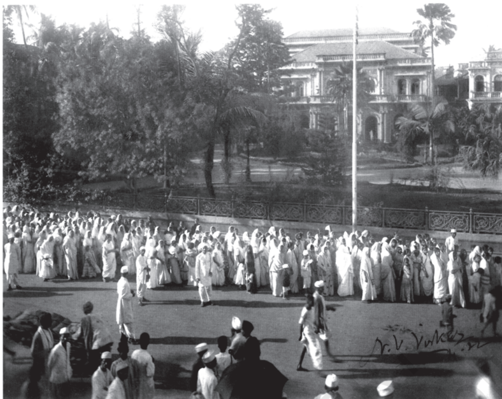
Fig. 9 – Women join nationalist processions. During the national movement, many women, for the first time in their lives, moved out of their homes on to a public arena. Amongst the marchers you can see many old women, and mothers with children in their arms.

picketed foreign cloth and liquor shops. Many went to jail. In urban areas these women were from high-caste families; in rural areas they came from rich peasant households. Moved by Gandhiji's call, they began to see service to the nation as a sacred duty of women. Yet, this increased public role did not necessarily mean any radical change in the way the position of women was visualised. Gandhiji was convinced that it was the duty of women to look after home and hearth, be good mothers and good wives. And for a long time the Congress was reluctant to allow women to hold any position of authority within the organisation. It was keen only on their symbolic presence.