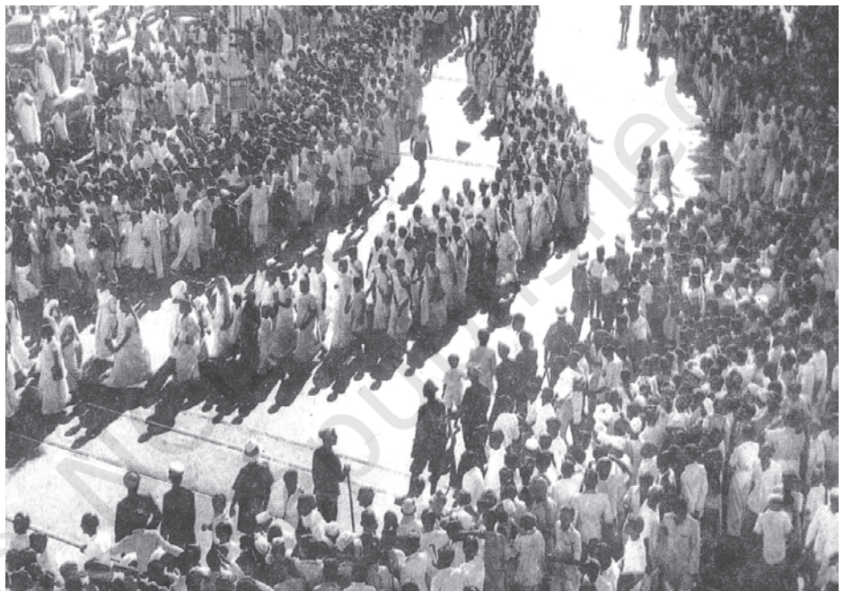
Fig. 14b Women's procession in Bombay during the Quit India Movement

A growing anger against the colonial government was thus bringing together various groups and classes of Indians into a common struggle for freedom in the first half of the twentieth century. The Congress under the leadership of Mahatma Gandhi tried to channel people's grievances into organised movements for independence. Through such movements the nationalists tried to forge a national unity. But as we have seen, diverse groups and classes participated in these movements with varied aspirations and expectations. As their grievances were wide-ranging, freedom from colonial rule also meant different things to different people. The Congress continuously attempted to resolve differences, and ensure that the demands of one group did not alienate another. This is precisely why the unity within the movement often broke down. The high points of Congress activity and nationalist unity were followed by phases of disunity and inner conflict between groups.