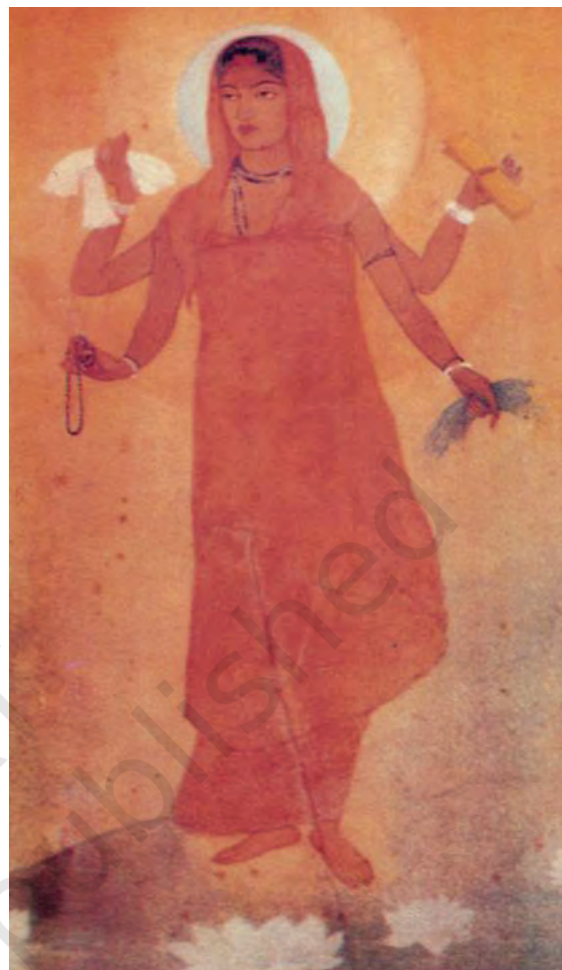
Fig. 12 – Bharat Mata, Abanindranath Tagore, 1905.

Ideas of nationalism also developed through a movement to revive Indian folklore. In late-nineteenth-century India, nationalists began recording folk tales sung by bards and they toured villages to gather folk songs and legends. These tales, they believed, gave a true picture of traditional culture that had been corrupted and damaged by outside forces. It was essential to preserve this folk tradition in order to discover one's national identity and restore a sense of pride in one's past. In Bengal, Rabindranath Tagore himself began collecting ballads, nursery rhymes and myths, and led the movement for folk