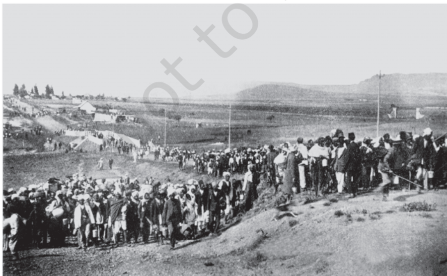
Fig. 2 – Indian workers in South Africa march through Volksrust, 6 November 1913.

Mahatma Gandhi returned to India in January 1915. As you know, he had come from South Africa where he had successfully fought