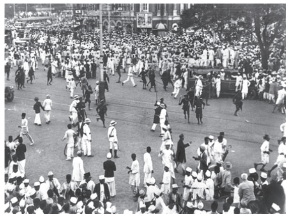
Fig. 8 – Police cracked down on satyagrahis, 1930.

In such a situation, Mahatma Gandhi once again decided to call off the movement and entered into a pact with Irwin on 5 March 1931. By this Gandhi-Irwin Pact, Gandhiji consented to participate in a Round Table Conference (the Congress had boycotted the first