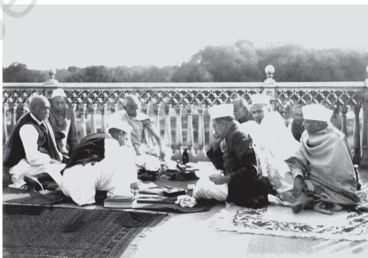
Fig. 6 – Meeting of Congress leaders at Allahabad, 1931. Apart from Mahatma Gandhi, you can see Sardar Vallabhbhai Patel (extreme left), Jawaharlal Nehru (extreme right) and Subhas Chandra Bose (fifth from right).

Lala Lajpat Rai was assaulted by the British police during a peaceful demonstration against the Simon Commission. He succumbed to injuries that were inflicted on him during the demonstration.