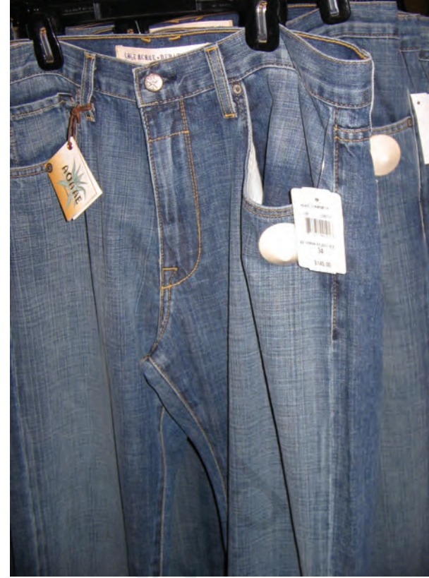
Jeans produced in developing countries being sold in USA for Rs 6500 ($145)

There's another way in which MNCs control production. Large MNCs in developed countries place orders for production with small producers. Garments, footwear, sports items are examples of industries where production is carried out by a large number of small producers around the world.