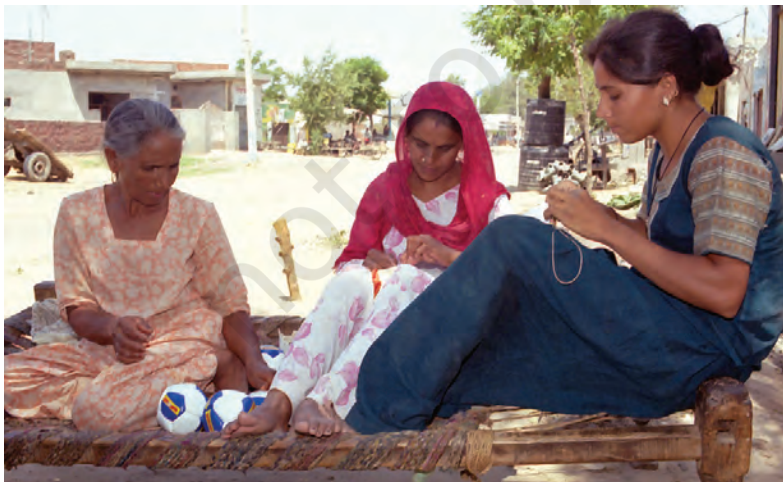
Women at home in Ludhiana making footballs for large MNCs

Thus, we see that there are a variety of ways in which the MNCs are spreading their production and interacting with local producers in various countries across the globe. By setting up partnerships with local companies, by using the local companies for supplies, by closely competing with the local companies or buying them up, MNCs are exerting a strong influence on production at these distant locations. As a result, production in these widely dispersed locations is getting interlinked.