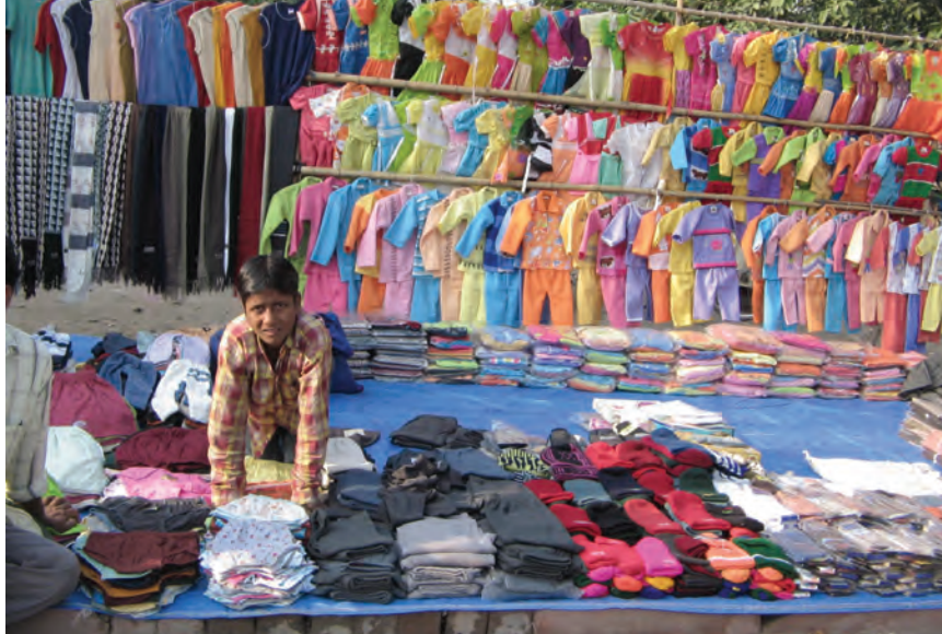
Small traders of readymade garments facing stiff competition from both the MNC brands and imports.

In general, with the opening of trade, goods travel from one market to another. Choice of goods in the markets rises. Prices of similar goods in the two markets tend to become equal. And, producers in the two countries now closely compete against each other even though they are separated by thousands of miles! Foreign trade thus results in connecting the markets or integration of markets in different countries.