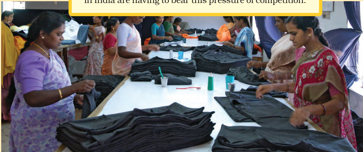
Factory workers folding garments for export. Though globalisation has created opportunities for paid work for women, the condition of employment shows that women are denied their fair share of benefits.

Let us see how the workers in the garment export industry in India are having to bear this pressure of competition.