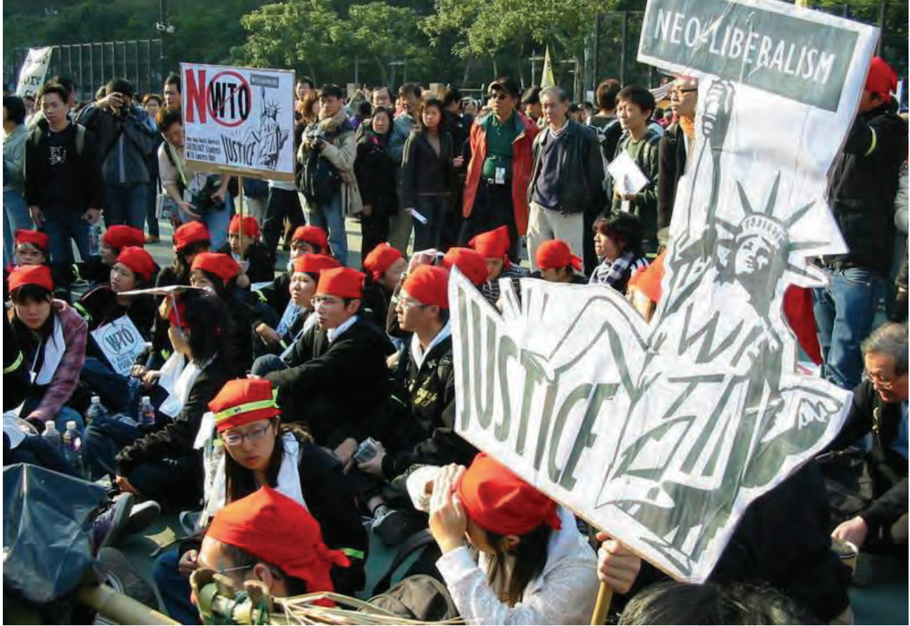
A demonstration against WTO in Hong Kong, 2005