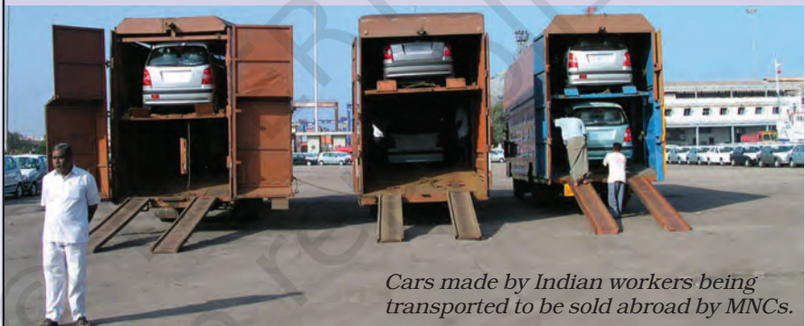
Cars made by Indian workers being transported to be sold abroad by MNCs.