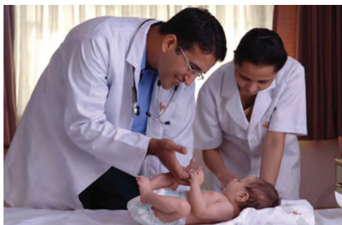
Most babies require basic healthcare

The problem does not end with Infant Mortality Rate. The last column of table 1.4 shows that about one-third of the children aged 15–17 years in Bihar are not attending school in secondary classes. This means that if you went to school in Bihar nearly one-third of your class friends would be missing. Those who could have been in school are not there! If this had happened to you, you would not be able to read what you are reading now.