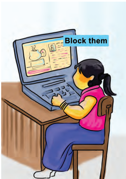
Fig. 7.5: Block

Take a screenshot of anything that you think could be cyber bullying and keep a record of it.