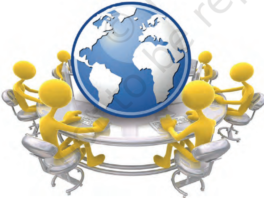
Fig. 7.1: Cyber World

Since childhood our parents and elders have been guiding and suggesting us to take care of our eating habits, practice hygiene, be wary of strangers, communicate effectively and so on to ensure that we develop into confident, strong and positive individuals who are able to cope up with the competition and complexities of the real world. With the advent of