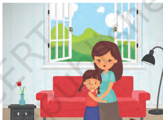
Fig. 7.6: Talk about it

Cyber bullying may affect you in many different ways. Don't feel that you are alone. Let your parents and teachers know what is going on. Never keep it to yourself.