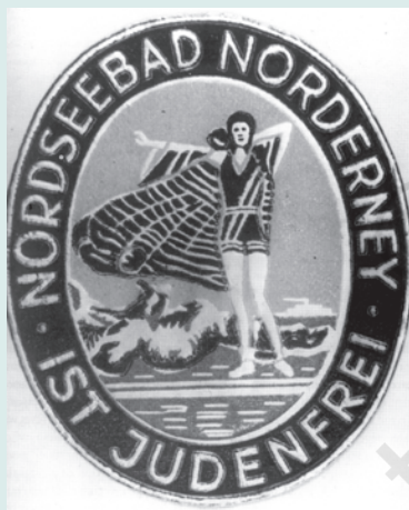
Fig.15 – The sign declares that this North Sea bathing resort is free of Jews.

Besides, Jewish properties were vandalised and looted, houses attacked, synagogues burnt and men arrested in a pogrom in November, 1938, remembered as 'the night of broken glass'