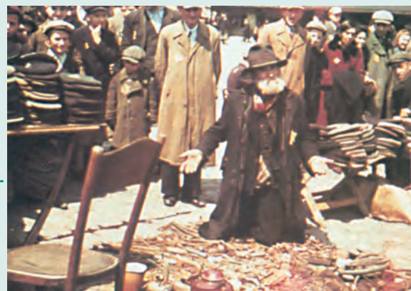
Fig.17 – 'This is all I have to sell'. Men and women were left with nothing to survive in the ghettos.

From September 1941, all Jews had to wear a yellow Star of David on their breasts. This identity mark was stamped on their passport, all legal documents and houses. They were kept in Jewish houses in Germany, and in ghettos like Lodz and Warsaw in the east. These became sites of extreme misery and poverty. Jews had to surrender all their wealth before they entered a ghetto. Soon the ghettos were brimming with hunger, starvation and disease due to deprivation and poor hygiene.