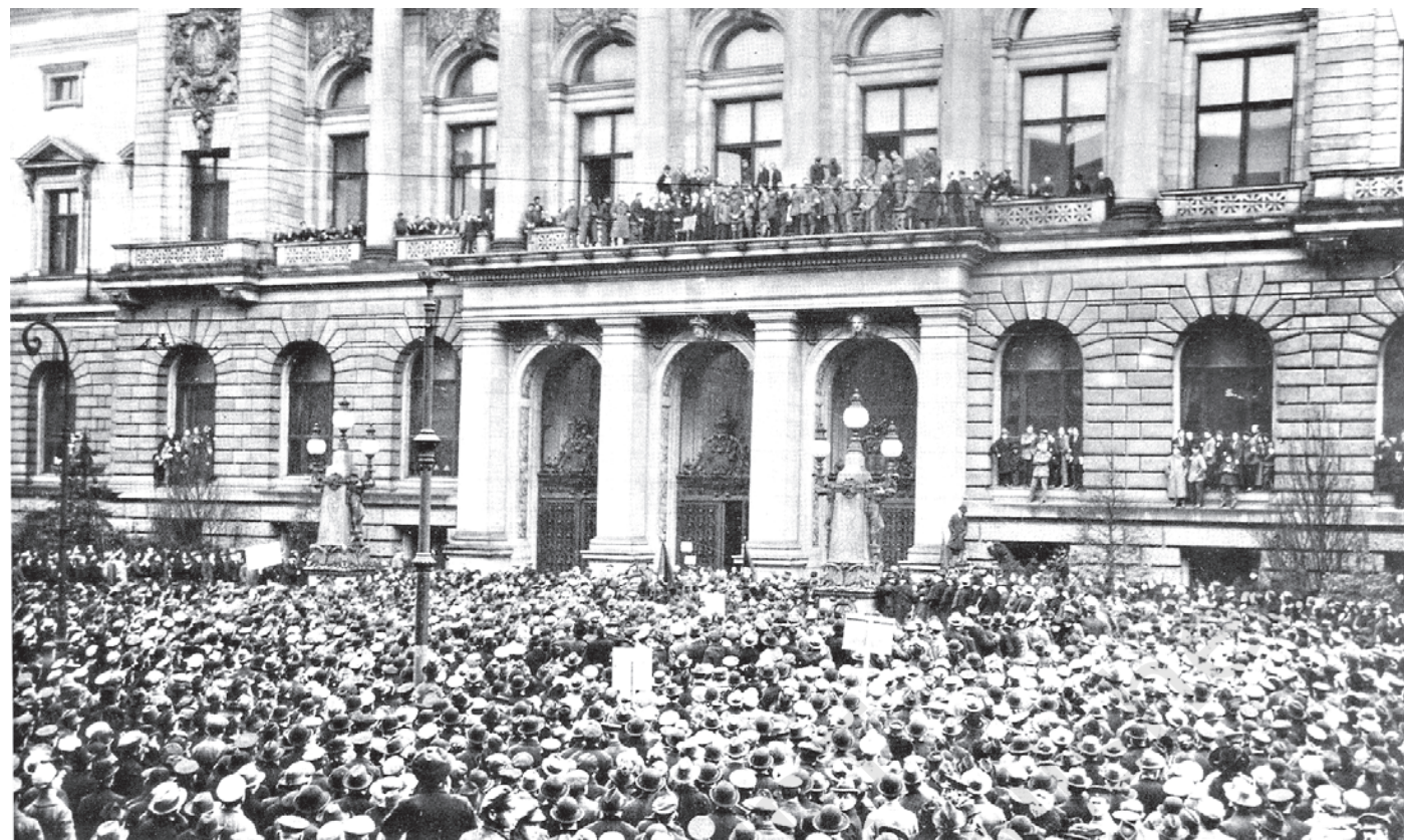
Fig.3 – This is a rally organised by the radical group known as the Spartacist League. In the winter of 1918-1919 the streets of Berlin were taken over by the people. Political demonstrations became common.

in many cities. The political atmosphere in Berlin was charged with demands for Soviet-style governance. Those opposed to this – such as the socialists, Democrats and Catholics – met in Weimar to give shape to the democratic republic. The Weimar Republic crushed the uprising with the help of a war veterans organisation called Free Corps. The anguished Spartacists later founded the Communist Party of Germany. Communists and Socialists henceforth became irreconcilable enemies and could not make common cause against Hitler. Both revolutionaries and militant nationalists craved for radical solutions.