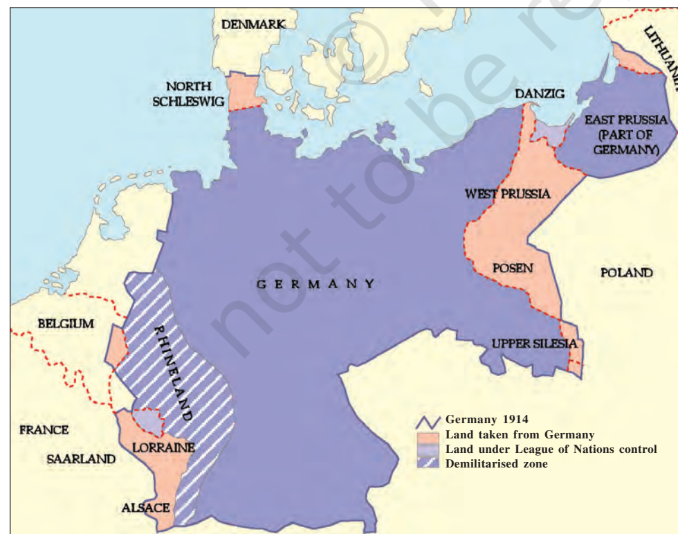
Fig.2 – Germany after the Versailles Treaty. You can see in this map the parts of the territory that Germany lost after the treaty.

This republic, however, was not received well by its own people largely because of the terms it was forced to accept after Germany's defeat at the end of the First World War. The peace treaty at