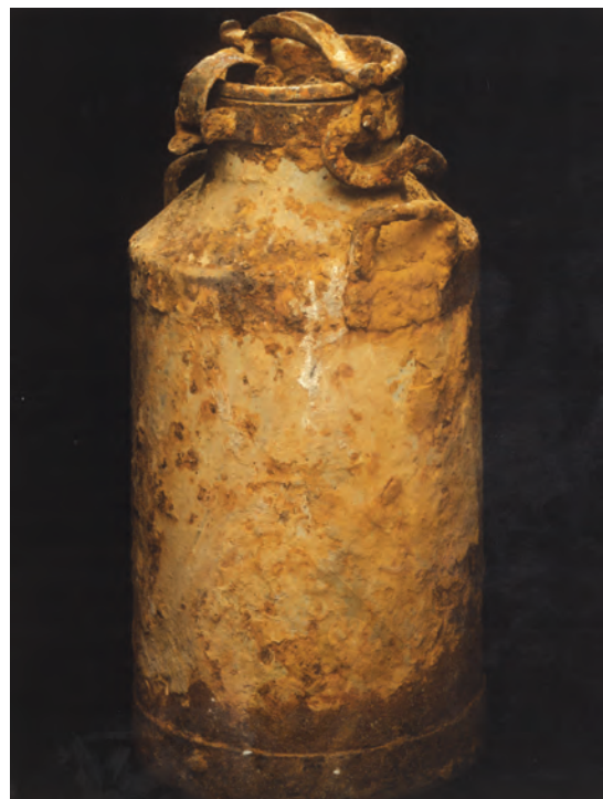
Fig. 31 – Inhabitants of the Warsaw ghetto collected documents and placed them in three milk cans along with other containers. As destruction seemed imminent, these containers were buried in the cellars of buildings in 1943. This can was discovered in 1950.

Yet the history and the memory of the Holocaust live on in memoirs, fiction, documentaries, poetry, memorials and museums in many parts of the world today. These are a tribute to those who resisted it, an embarrassing reminder to those who collaborated, and a warning to those who watched in silence.