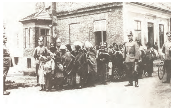
Fig. 13 – Police escorting gypsies who are being deported to Auschwitz, 1943-1944.

Under the shadow of war, the Nazis proceeded to realise their murderous, racial ideal. Genocide and war became two sides of the same coin. Occupied Poland was divided up. Much of north-western Poland was annexed to Germany. Poles were forced to leave their homes and properties behind to be occupied by ethnic Germans brought in from occupied Europe. Poles were then herded like