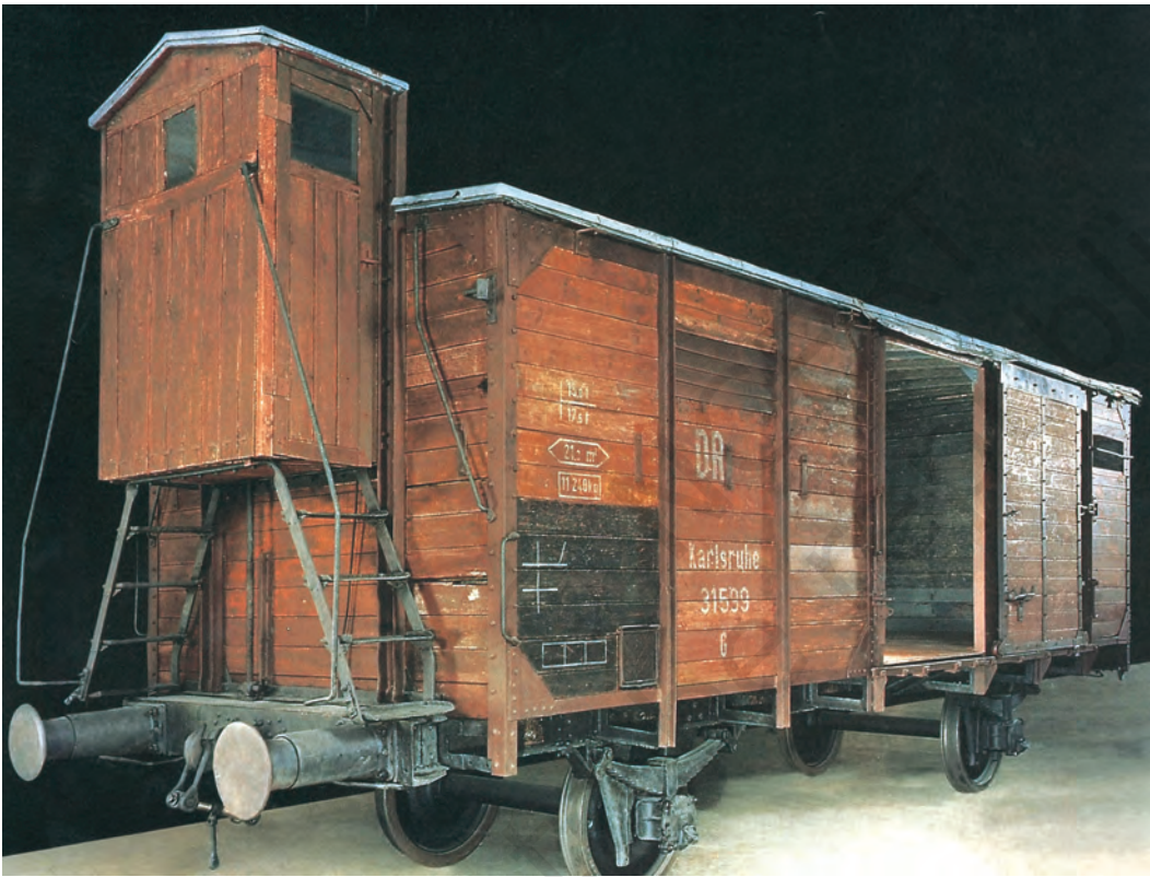
Fig. 14 – This is one of the freight cars used to deport Jews to the death chambers.