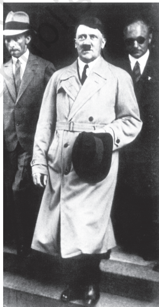
Fig. 1 – Hitler (centre) and Goebbels (left) leaving after an official meeting, 1932.

In May 1945, Germany surrendered to the Allies. Anticipating what was coming, Hitler, his propaganda minister Goebbels and his entire family committed suicide collectively in his Berlin bunker in April. At the end of the war, an International Military Tribunal at Nuremberg was set up to prosecute Nazi war criminals for Crimes against Peace, for War Crimes and Crimes Against Humanity. Germany's conduct during the war, especially those actions which