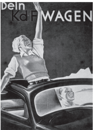
Fig. 10 – The poster announces: ‘Your volkswagen’. Such posters suggested that owning a car was no longer just a dream for an ordinary worker.

Hitler did not stop here. Schacht had advised Hitler against investing hugely in rearmament as the state still ran on deficit financing. Cautious people, however, had no place in Nazi Germany. Schacht had to leave. Hitler chose war as the way out of the approaching