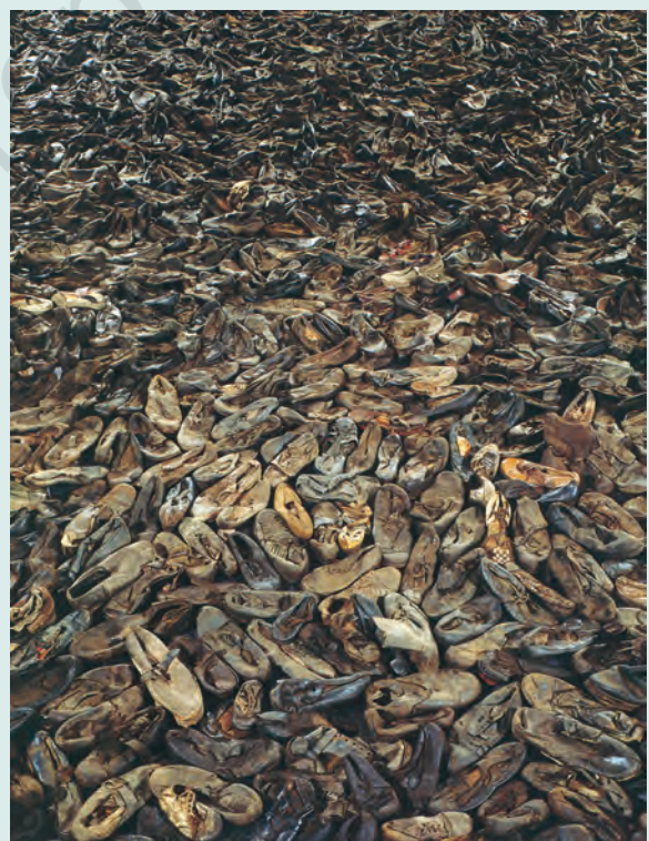
Fig. 22 – Shoes taken away from prisoners before the 'Final Solution'.