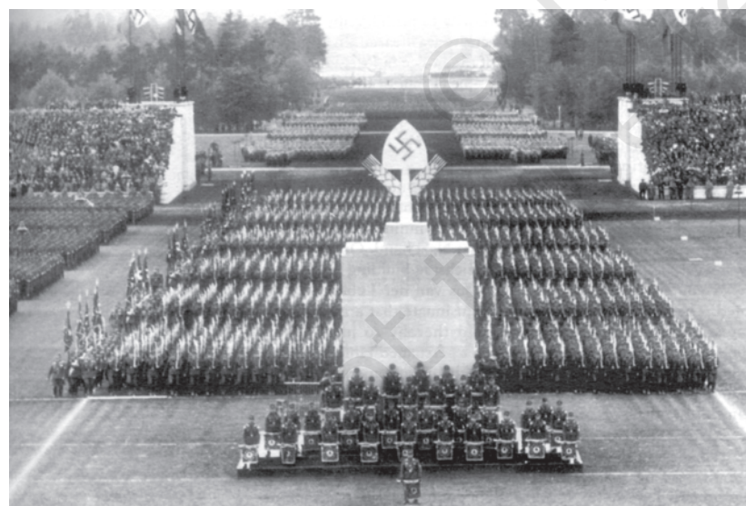
Fig.9 – Hitler addressing SA and SS columns. Notice the sweeping and straight columns of people. Such photographs were intended to show the grandeur and power of the Nazi movement

Hitler devised a new style of politics. He understood the significance of rituals and spectacle in mass mobilisation. Nazis held massive rallies