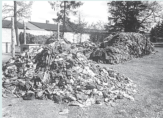
Fig. 19 – Piles of clothes outside the gas chamber.

Jews from Jewish houses, concentration camps and ghettos from different parts of Europe were brought to death factories by goods trains. In Poland and elsewhere in the east, most notably Belzek, Auschwitz, Sobibor, Treblinka, Chelmno and Majdanek, they were charred in gas chambers. Mass killings took place within minutes with scientific precision.