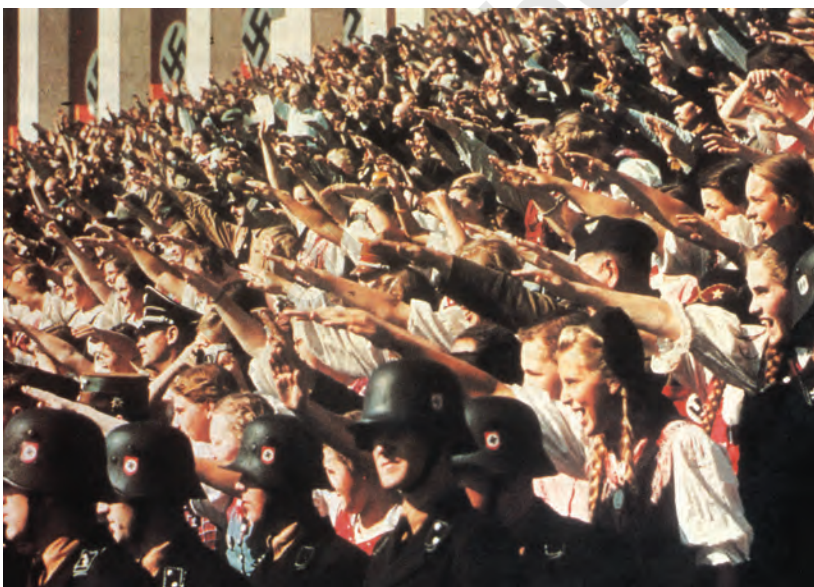
Fig. 7 – Hitler being greeted at the Party Congress in Nuremberg in 1938.

In 1923, Hitler planned to seize control of Bavaria, march to Berlin and capture power. He failed, was arrested, tried for treason, and later released. The Nazis could not effectively mobilise popular support till the early 1930s. It was during the Great Depression that Nazism became a mass movement. As we have seen, after 1929, banks collapsed and businesses shut down, workers lost their jobs and the middle classes were threatened with destitution. In such a situation Nazi propaganda stirred hopes of a better future. In 1928, the Nazi Party got no more than 2.6 per cent votes in the Reichstag – the German parliament. By 1932, it had become the largest party with 37 per cent votes.