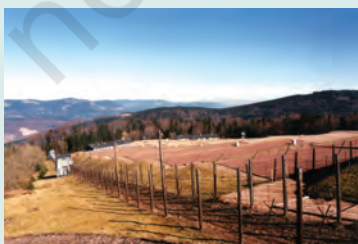
Fig. 21 – A concentration camp. A camera can make a death camp look beautiful.