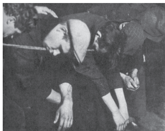
Fig. 6 – Sleeping on the line. During the Great Depression the unemployed could not hope for either wage or shelter. On winter nights when they wanted a shelter over their head, they had to pay to sleep like this.