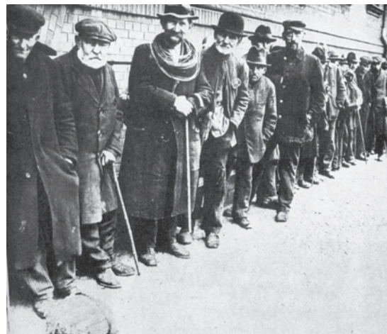
Fig. 5 – Homeless men queuing up for a night's shelter, 1923.

The economic crisis created deep anxieties and fears in people. The middle classes, especially salaried employees and pensioners, saw their savings diminish when the currency lost its value. Small businessmen, the self-employed and retailers suffered as their