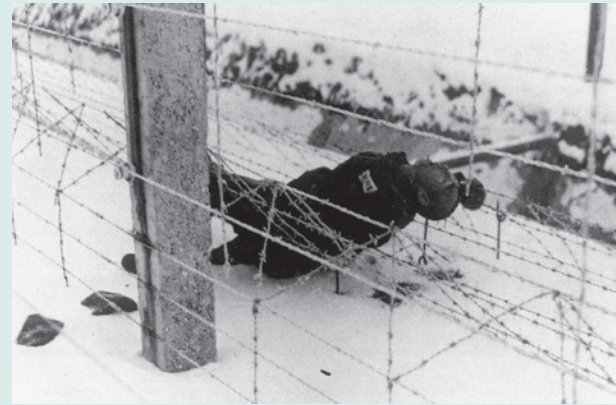
Fig. 18 – Killed while trying to escape. The concentration camps were enclosed with live wires.