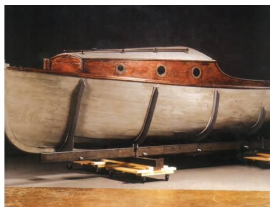
Fig. 32 – Denmark secretly rescued their Jews from Germany. This is one of the boats used for the purpose.