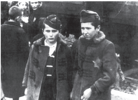
Fig.27 – Jewish children arriving at a death factory to be gassed

Robert Lay, head of the German Labour Front, said: 'We start when the child is three years old. As soon as he even starts to think, he is given a little flag to wave. Then comes school, the Hitler Youth, military service. But when all this is over, we don't let go of anyone. The labour front takes hold of them, and keeps hold until they go to the grave, whether they like it or not.'