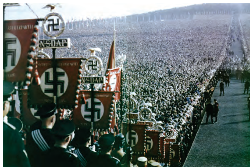
Fig.8 – Nuremberg Rally, 1936. Rallies like this were held every year. An important aspect of these was the demonstration of Nazi power as various organisations paraded past Hitler, swore loyalty and listened to his speeches.

Hitler was a powerful speaker. His passion and his words moved people. He promised to build a strong nation, undo the injustice of the Versailles Treaty and restore the dignity of the German people. He promised employment for those looking for work, and a secure future for the youth. He promised to weed out all foreign influences and resist all foreign ‘conspiracies’ against Germany.