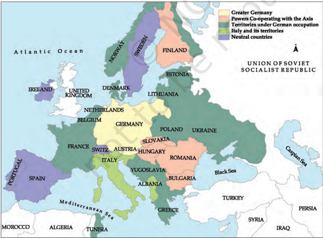
Fig. 11 – Expansion of Nazi power: Europe 1942.