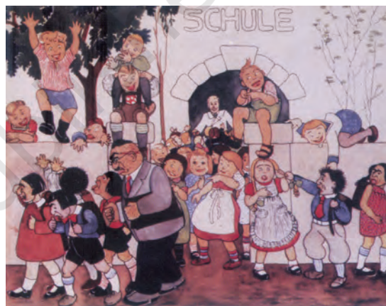
Fig. 24 – Jewish teacher and Jewish pupils expelled from school under the jeers of classmates.

From Der Giftpilz (The Poison Mushroom) by Ernst Hiemer (Nuremberg: der Sturmer , 1938), p. 7. Caption reads: 'The Jewish nose is bent at its point. It looks like the number six.'