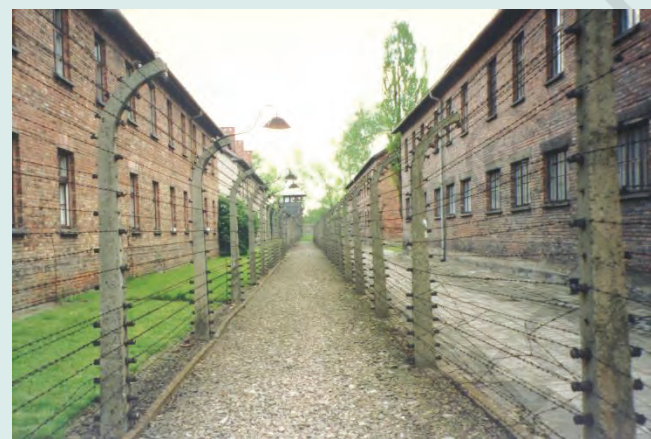
Fig. 20 – A Concentration Camp.

Jews from Jewish houses, concentration camps and ghettos from different parts of Europe were brought to death factories by goods trains. In Poland and elsewhere in the east, most notably Belzek, Auschwitz, Sobibor, Treblinka, Chelmno and Majdanek, they were charred in gas chambers. Mass killings took place within minutes with scientific precision.