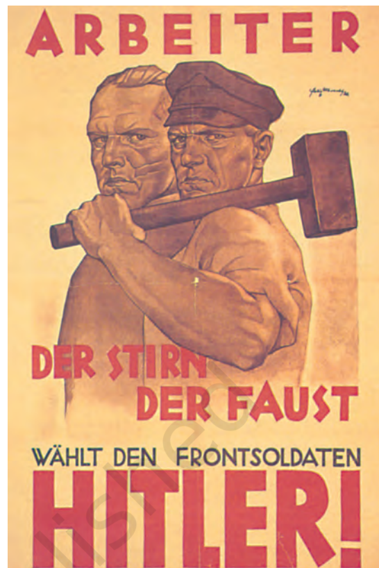
Fig.30 – A Nazi party poster of the 1920s. It asks workers to vote for Hitler, the frontline soldier.