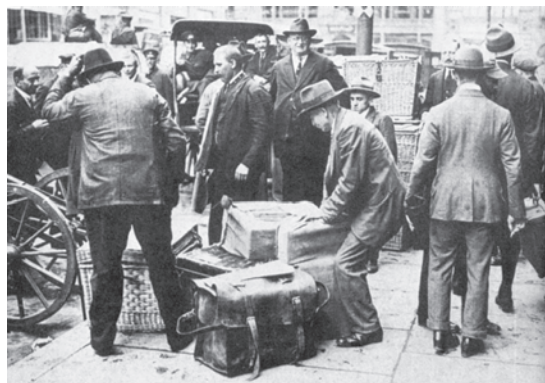
Fig.4 – Baskets and carts being loaded at a bank in Berlin with paper currency for wage payment, 1923. The German mark had so little value that vast amounts had to be used even for small payments.