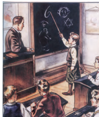
Fig. 23 – Classroom scene depicting a lesson on racial anti-Semitism.

Jungvolk – Nazi youth groups for children below 14 years of age.