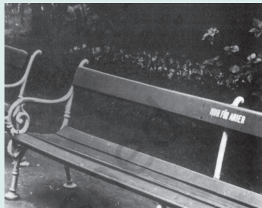
Fig.16 – Park bench announces: 'FOR ARYANS ONLY'