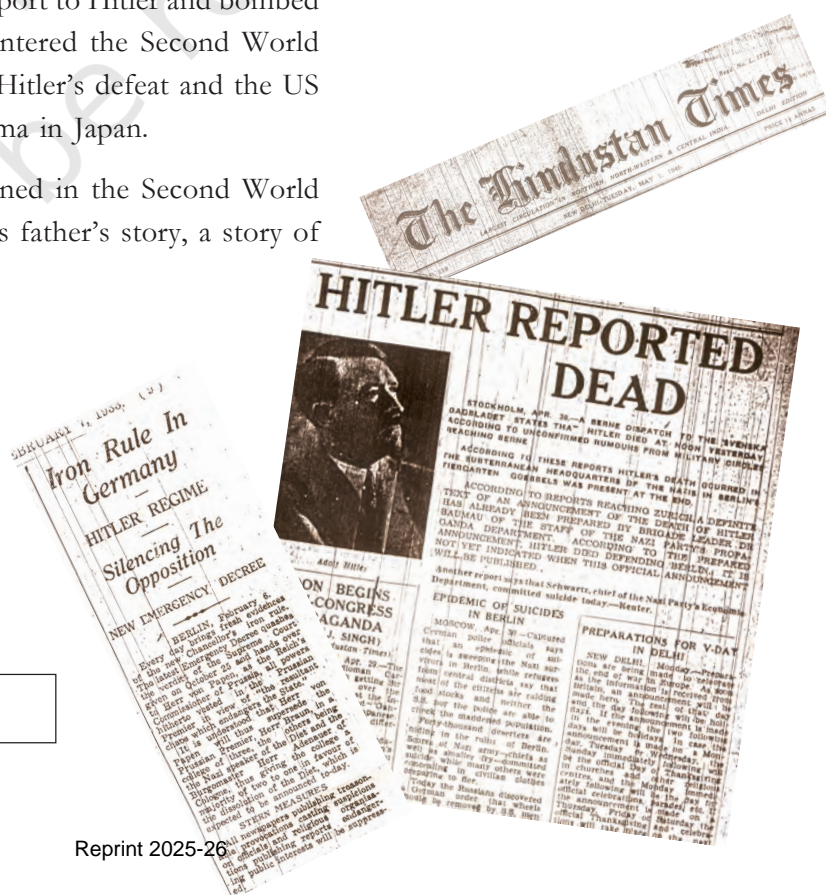
Fig. 12 – Newspapers in India track the developments in Germany.