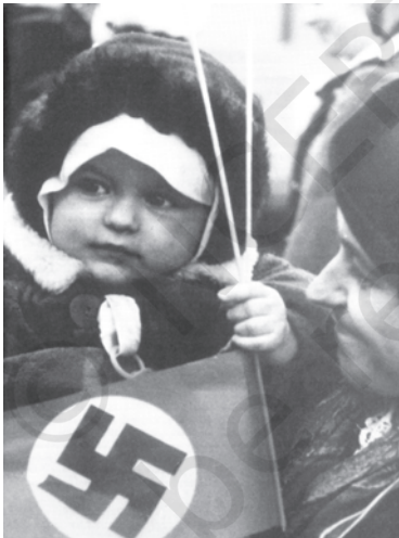
Fig.26 – A German-blooded infant with his mother being brought from occupied Europe to Annexed Poland for settlement.