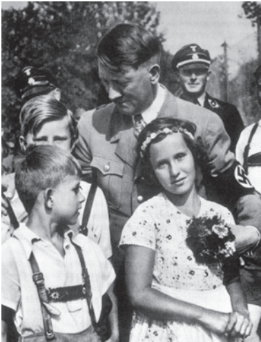
Fig.25 – 'Desirable' children that Hitler wanted to see multiplied.