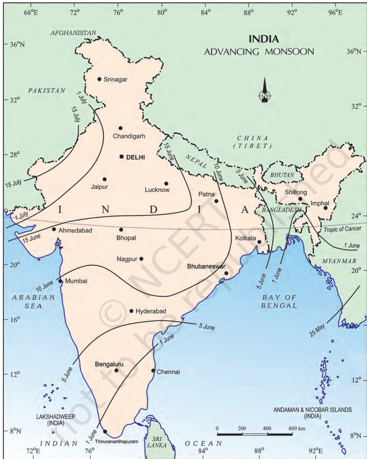
Figure 4.1 : Advancing Monsoon