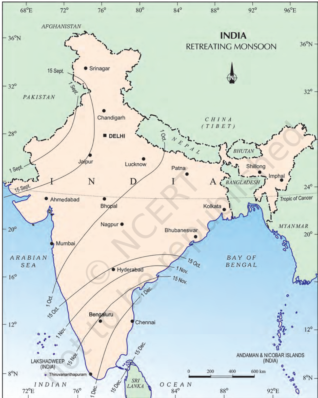
Figure 4.2 : Retreating Monsoon