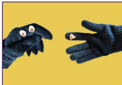
Glove puppet conversation