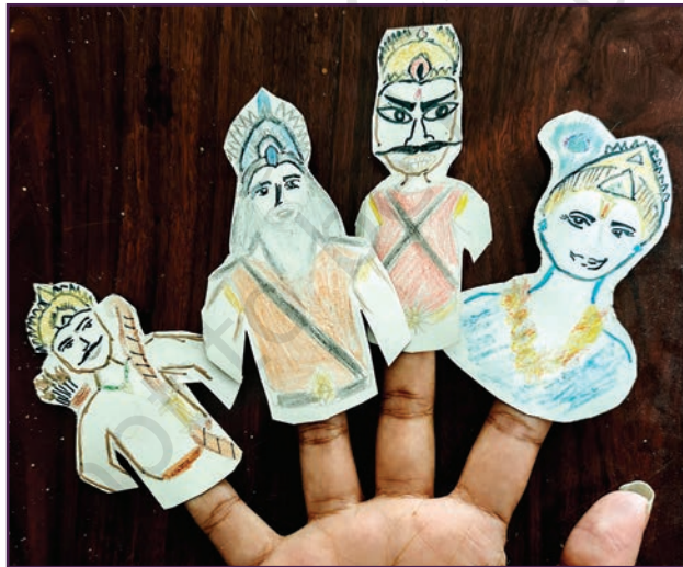
Characters from purana and itihasa