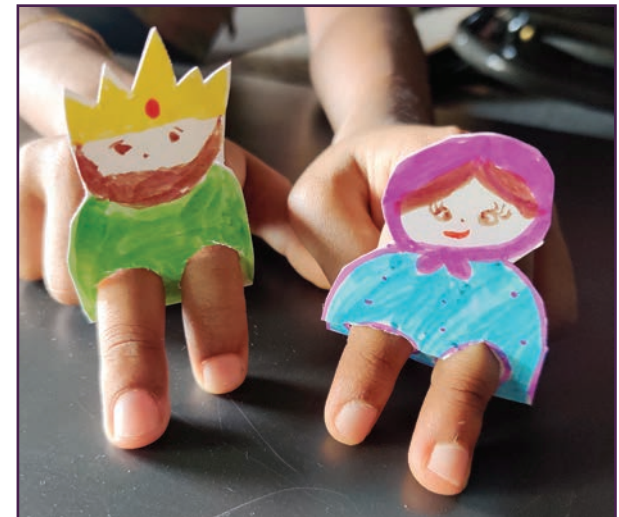
Use your fingers as legs