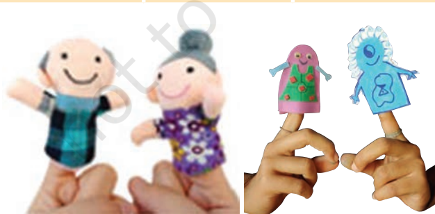
Finger puppet conversation