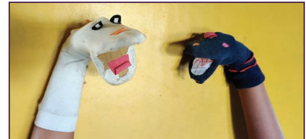
Sock puppet conversation

Present this show in your class or to your family. You are now a puppeteer!