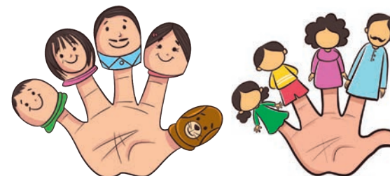
Simple finger puppets

Use paper to create a simple cup with scissors and glue, wear it on