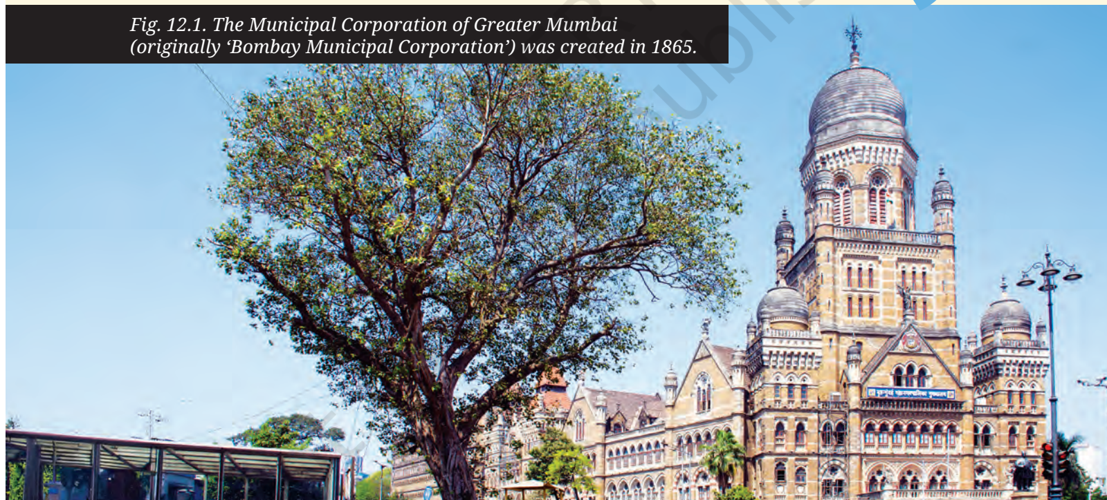
Fig. 12.1. The Municipal Corporation of Greater Mumbai (originally 'Bombay Municipal Corporation') was created in 1865.