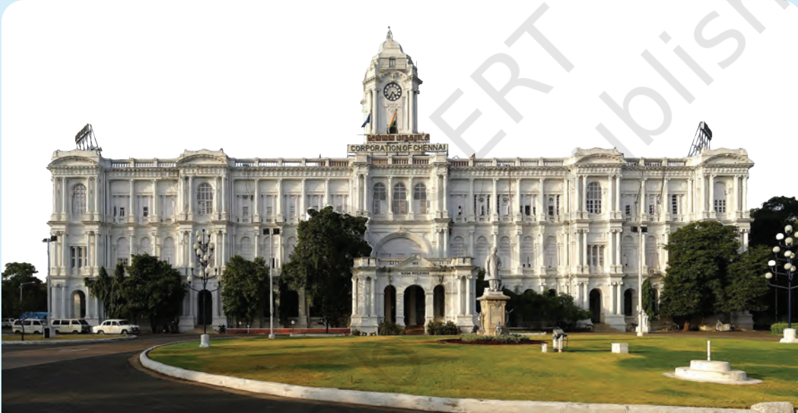
Fig. 12.3. The Madras Corporation

The Madras Corporation (now Greater Chennai Corporation), established on 29 September 1688, is the oldest municipal institution in India. The East India Company issued a charter the previous year constituting the town of 'Fort St. George' and all territories within 16 km from the Fort into a corporation. A Parliamentary Act of 1792 gave the Madras Corporation power to levy municipal taxes in the city, which is when the municipal administration properly began.