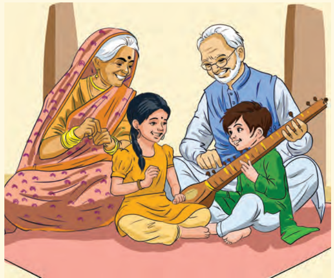
Examples of joint families