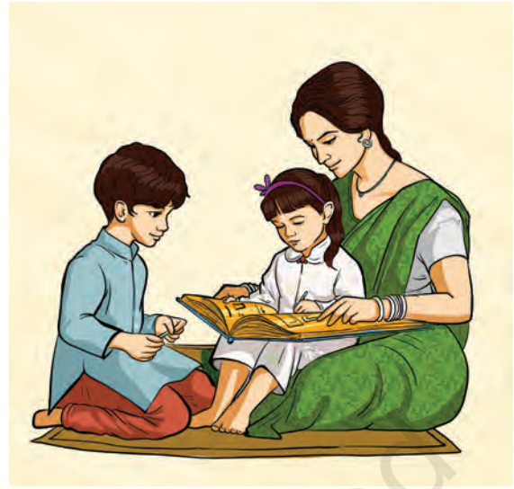
Examples of nuclear families

brothers, sisters and cousins. A nuclear family, on the other hand, is limited to a couple and their children, and sometimes one parent and children.