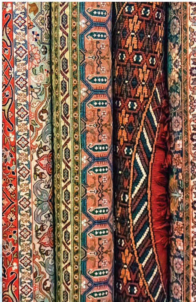
Fig. 8.3. A few specimens of colourful traditional Indian textiles.

Explain how the example of the sari reflects both unity and diversity (in 100-150 words).