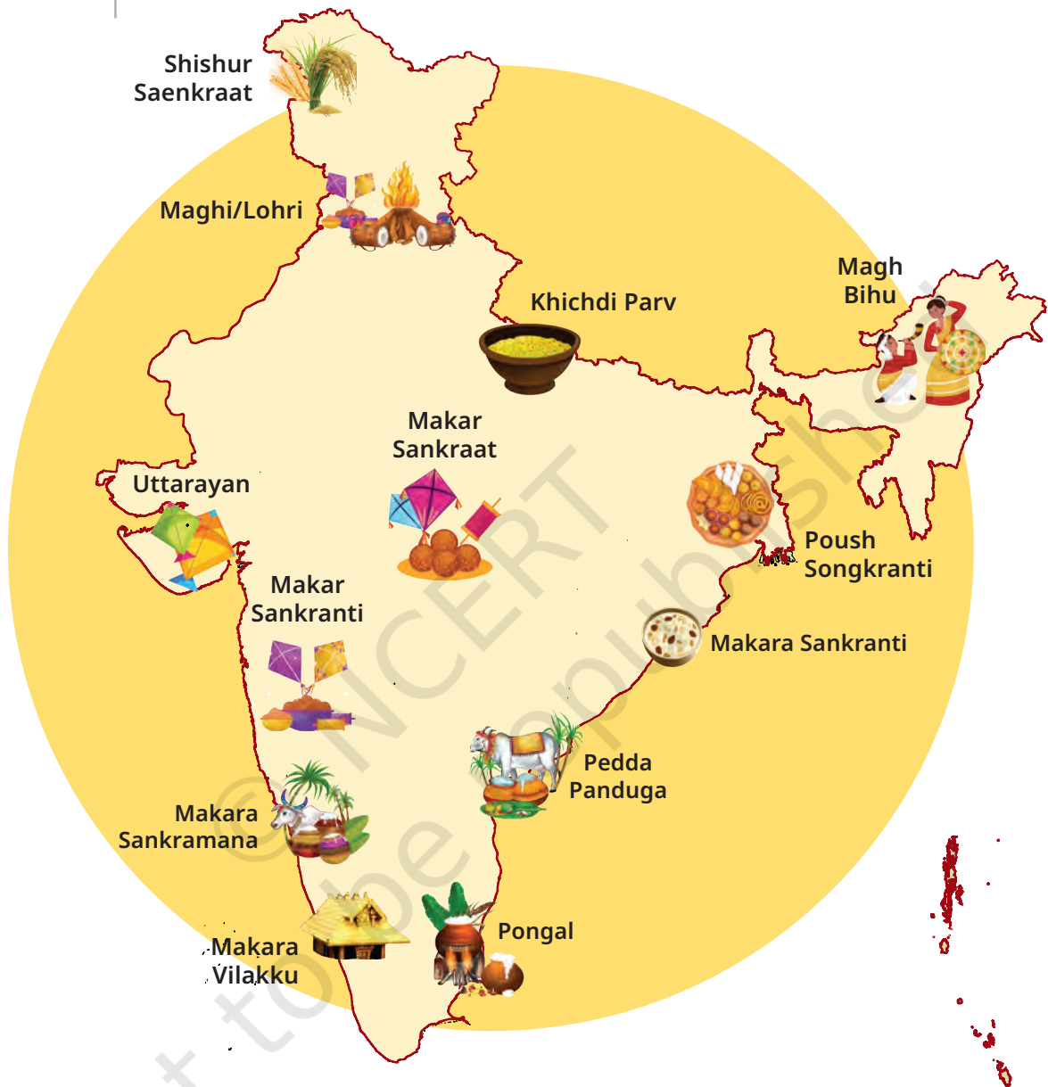
Fig. 8.5. Different names of similar festivals across India about the same date

parts of India on or around January 14. The map shows the different names of similar festivals across India about the same date.