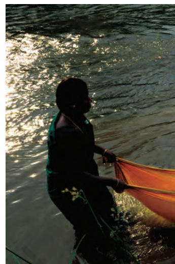
Fig. 8.4. Women often put the sari to many uses beyond that of a dress (pictures from south India).