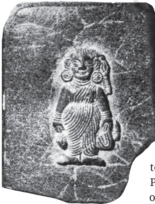
Fig. 8.2. Stone relief of a woman in a sari from Vaiśhali (today in Bihar)

Every region and community in India has developed its own styles of clothing and dresses. Yet, we notice a commonality in some traditional Indian dresses, irrespective of the material used. An obvious example is the plain length of cloth called the sari, a type of clothing worn in most parts of India and made from different fabrics — mostly cotton or silk, but nowadays synthetic fabrics too. Banarasi, Kanjivaram, Paithani, Patan Patola, Muga or Mysore are some of the famous types of silk saris. There are many more kinds of cotton saris. Altogether, this unstitched piece of cloth comes in hundreds of varieties. They are