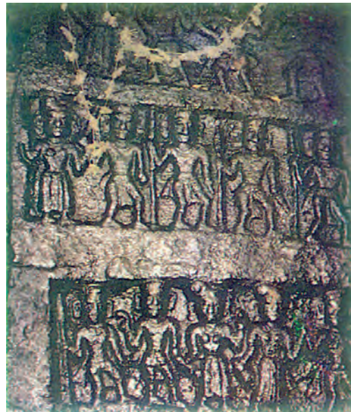
Fig. 8.7. 'Pañcha Pāṇḍavar', a carved stone in a forest of the Nilgiris, Tamil Nadu, depicting the five Pāṇḍava brothers. The shrine containing this stone is maintained by Irula tribals to commemorate the Pāṇḍavas' passing through the area.

In the end, we should remember that Indian culture celebrates diversity as an enrichment, but never loses sight of the underlying unity which nourishes that diversity.