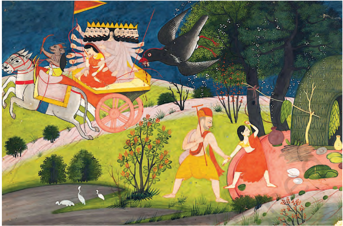
Fig. 8.6. A painting depicting a major episode from the Rāmāyaṇa (18 th century, Himachal Pradesh)