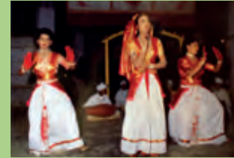
Ankiya Naat, Assam