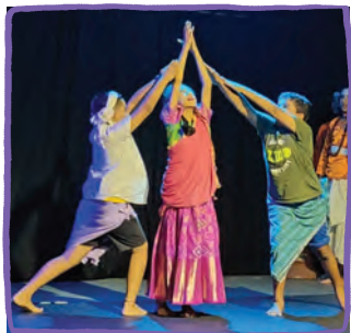
Praying for a safe shelter

Instructions: You are given a keyword. You can discuss and plan in your group for 3 mins. All in the group take different positions to depict the scene. Do not take difficult positions that might hurt you. Remember, everyone's position is equally important to depict the whole theme. No talking is allowed while acting or depicting.