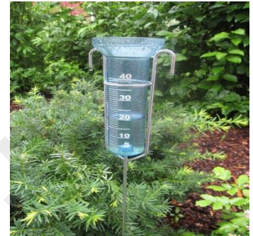
A rain gauge- for measuring the amount of rainfall, a rain gauge should be erected in an open space.