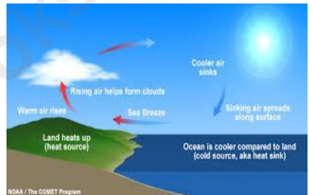
Sea breeze and the land breeze

Land is a bad conductor and a good radiator of heat. Therefore, it quickly gets heated during the day. This results in building a low pressure area over the land and a high pressure area over the sea. Because winds blow from the high pressure area to the low pressure area, winds from sea blow towards the land. They are known as sea breeze . During the nights, the land cools down rapidly creating high pressure conditions. Thus, the land breeze blows from the land to the oceans.