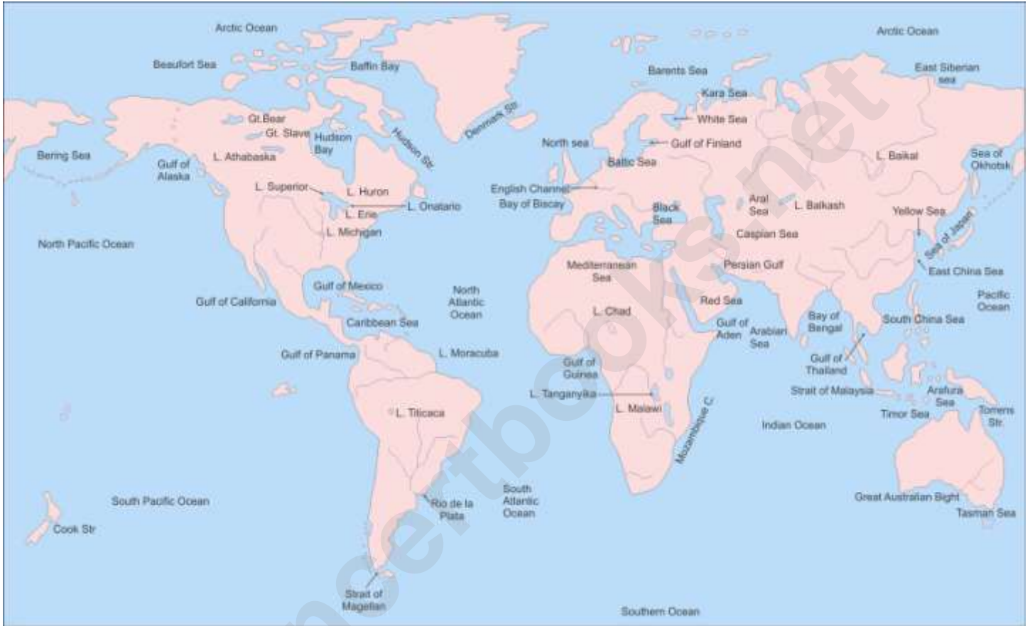
Map showing oceans, important seas, Lakes Bays and Gulfs