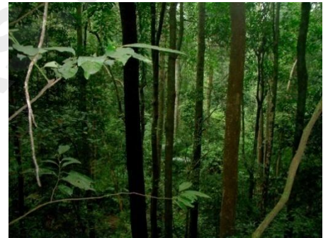
All the trees in the evergreen forests do not shed their leaves at the same time. Hence, they always appear green.

Distribution: These forests are found in areas of heavy rainfall in the Western Ghats, the Lakshadweep, the Andaman and Nicobar Islands, upper parts of Assam and the coast of Tamil Nadu.